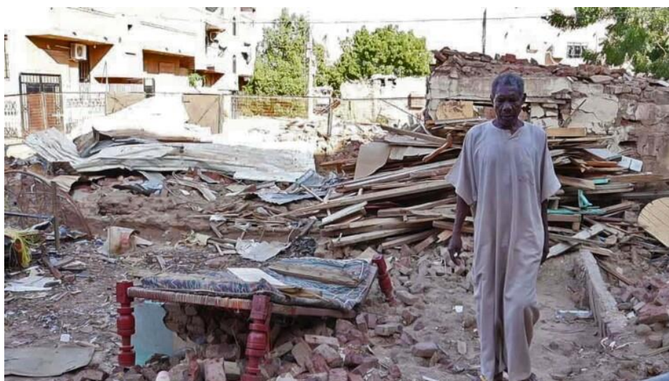
Indiscriminate bombing in Khartoum has destroyed countless neighbourhoods. A family's home destroyed.