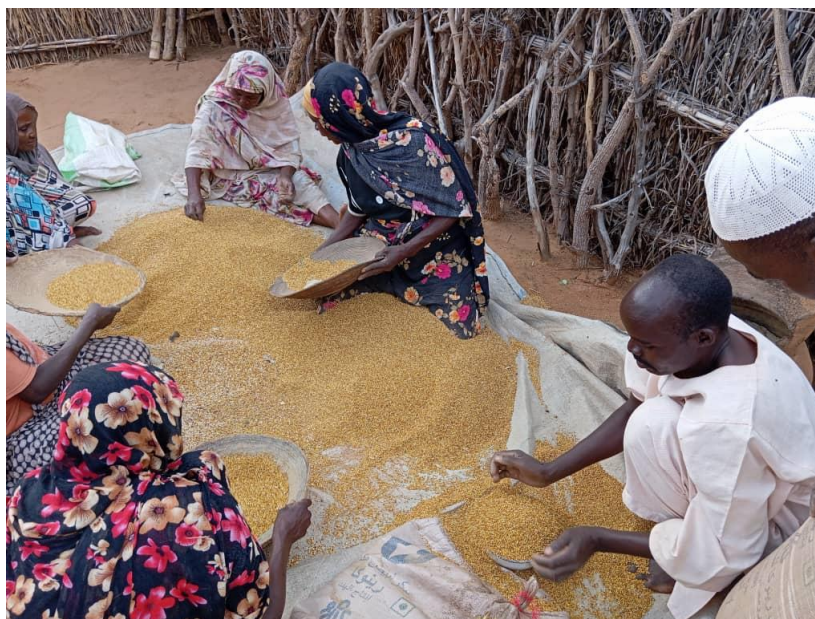
Preparing grain for distribution to individual families with small children in Abu Digeise

With the situation in Darfur so critical, and with Kids for Kids proving it is possible to get life-saving help through to children and families, there has never been a more important time to sustain what we are achieving.