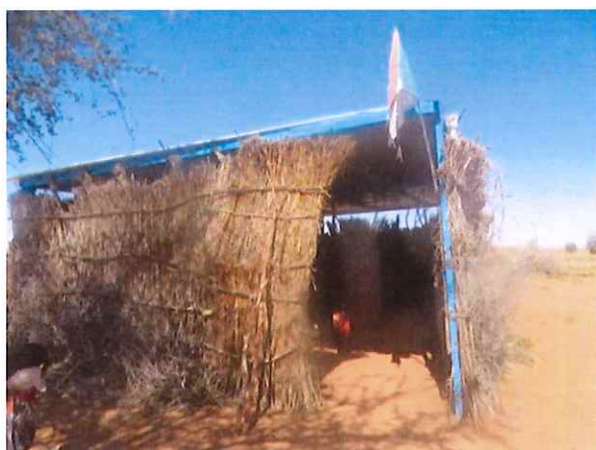
Village school – before