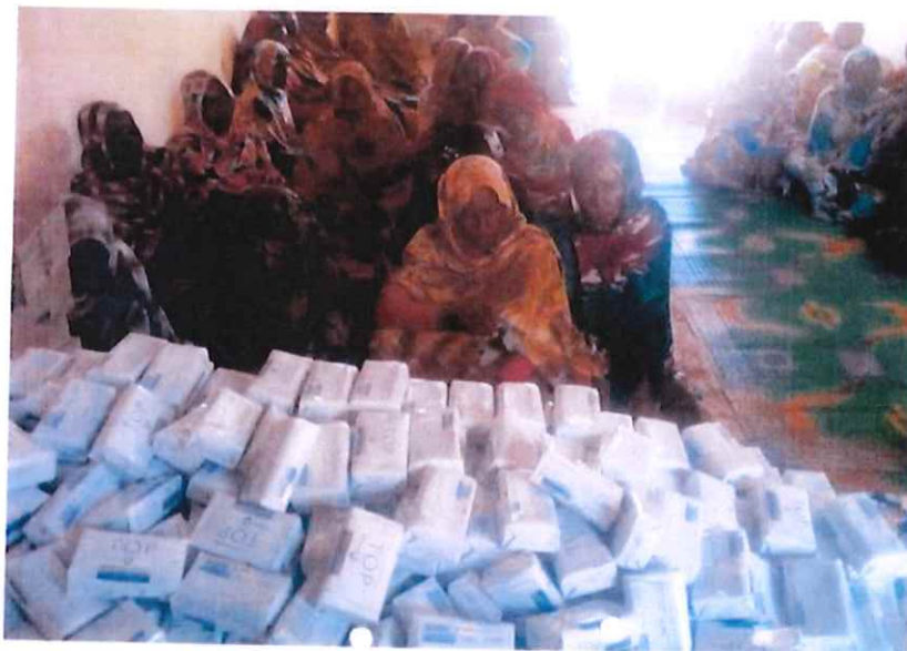
Distribution of soap continues to the new villages – 5 for each family