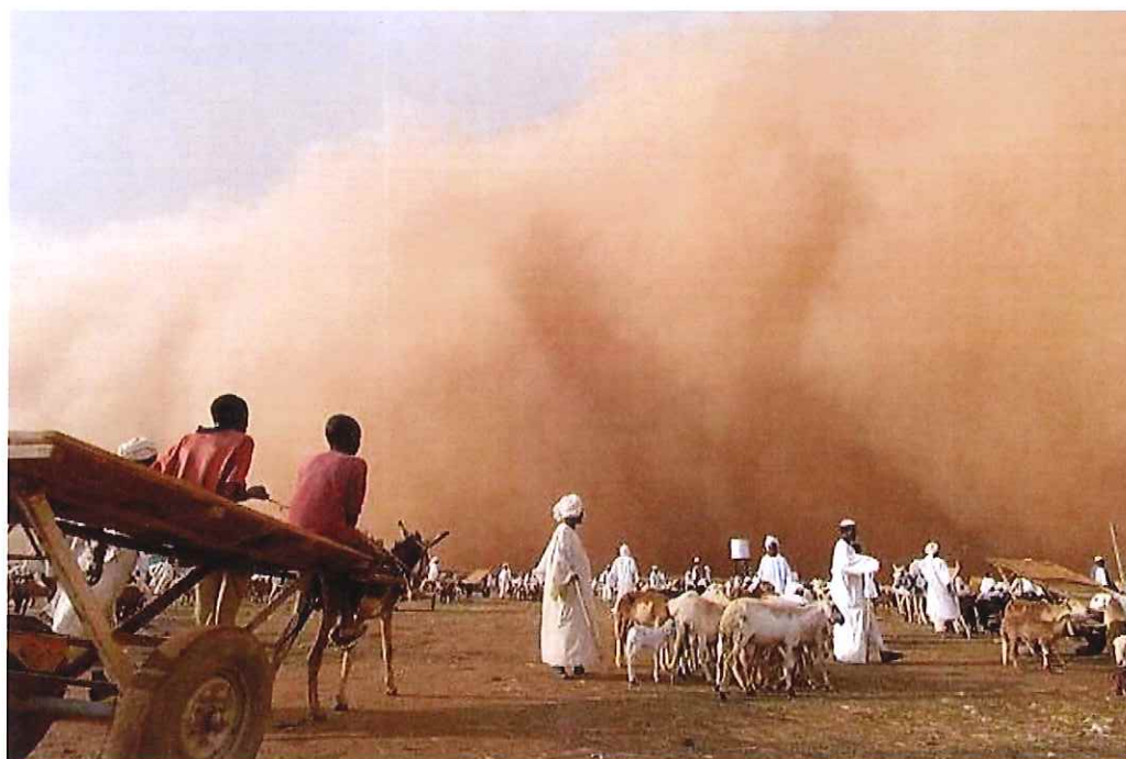
Darfur is at the front of climate change – sandstorm over the market