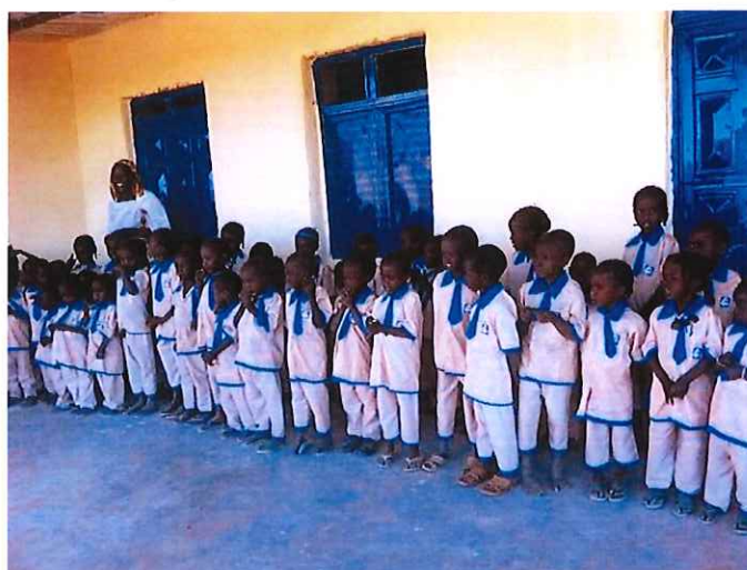
Kids for Kids' Kindergarten - after