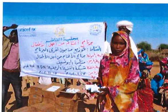
Distributing soap in Gerni village

The biggest challenge throughout the year has been the pandemic. If it is not controlled in Africa the whole world will continue to suffer, yet the richer countries, our own included, are protecting themselves and giving little support to countries that have inadequate healthcare. In Darfur, there is no possibility of treatment or even diagnosis. Last year I reported the launch of our massive Soap Appeal. I am enormously proud of our team in Sudan - we did what we aimed to do – provided five bars of soap to every family in all our 100 villages. But the Appeal, although it went well, only provided a third of the funds needed. The rest came from our reserves. I am continuing to appeal for soap as a preventive to Covid – the only one possible – for our six new villages.