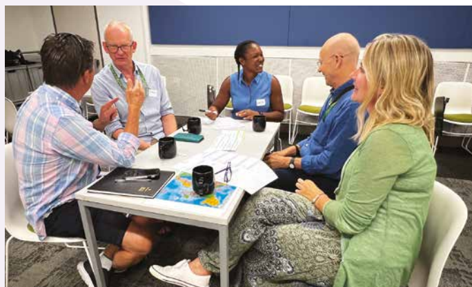
Supporting group conversations with people living with PPA