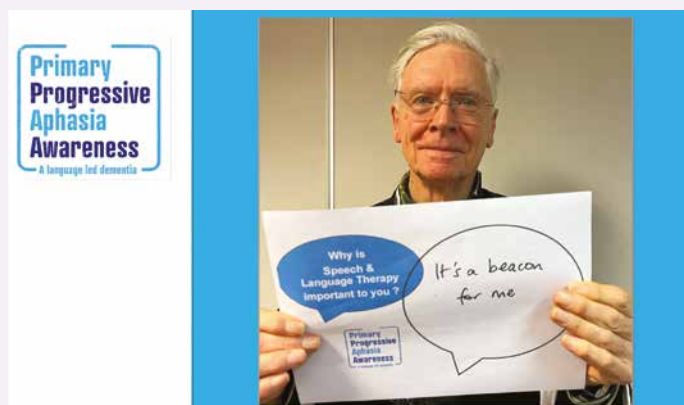
We asked people with PPA what Speech & Language Therapy meant to them