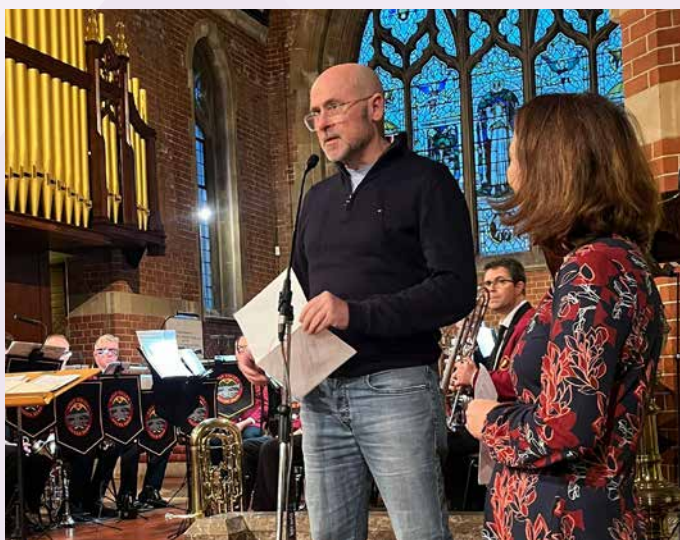
Mole Valley Silver Band Concert

The ambassadors also gave some impactful talks to community groups resulting in fundraising support and an invitation to a Rotary Conference in Guildford in October.