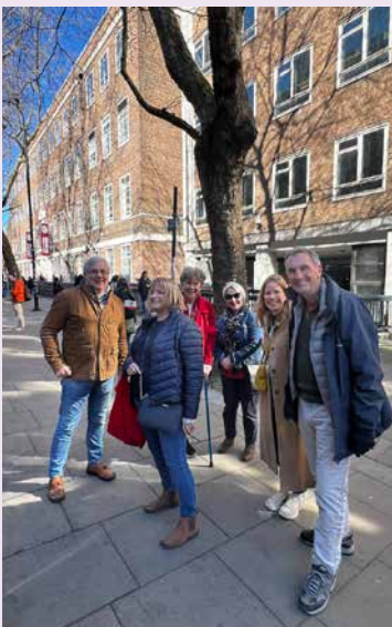
Dyscover members outside Birkbeck College