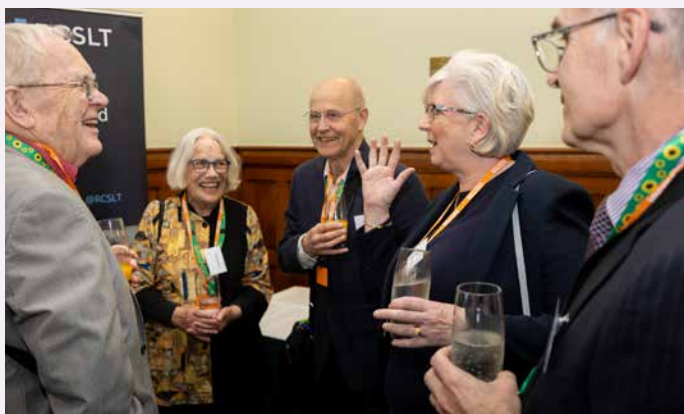
Campaigning for better access to SLT for PPA at Westminster