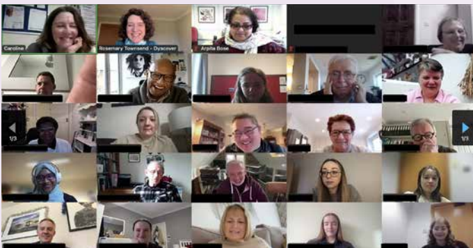
Reading University Workshop

"What an inspirational group of people!"