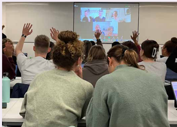
UCL students responding to an online workshop with Dyscover members

We hope to continue presenting in this way, reaching out to more people with aphasia and raising awareness within a digital framework.