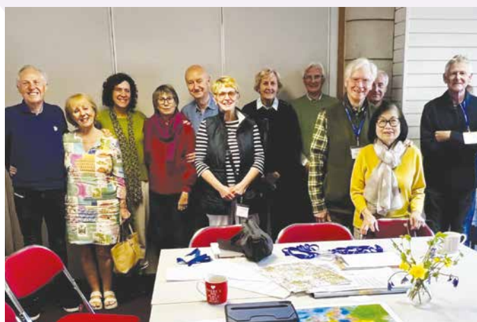
One of our small PPA groups which meet quarterly for ongoing support

Dyscover's work continues to meet a vital and growing need within the PPA community.