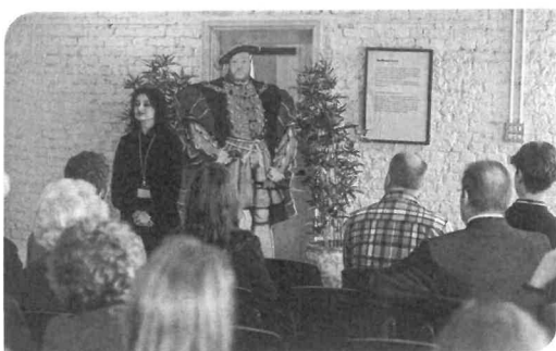
Hampton Court Cranmer Awards candidate