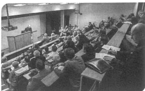
PBS Annual Conference at Liverpool Hope University