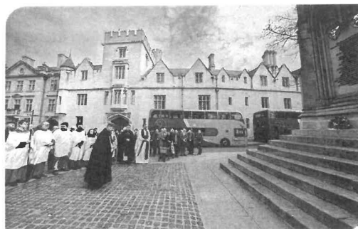
The commemoration of the Martyrdom of Thomas Cranmer, Oxford