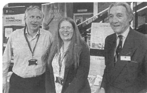
The PBS team at the Prison Chaplains Conference