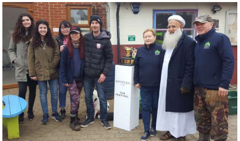
THE LEGENDARY GOLD CUP FROM CHELTENHAM RACECOURSE VISITS ST JAMES CITY FARM