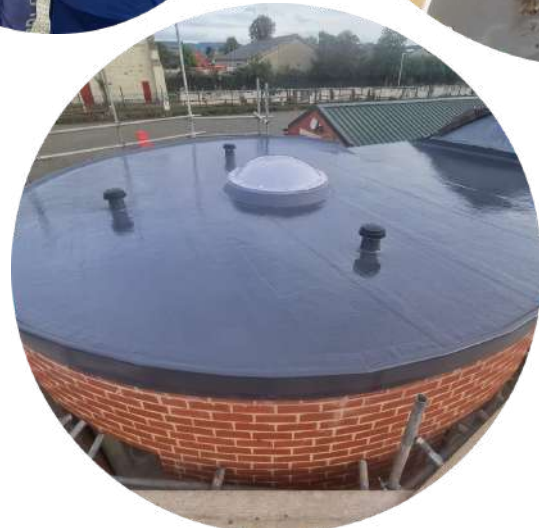
RAIN DAMAGED FARM COFFEE SHOP ROOF (ABOVE) FINALLY GETS REPAIRED- READY TO OPEN IN AUTUMN 2023