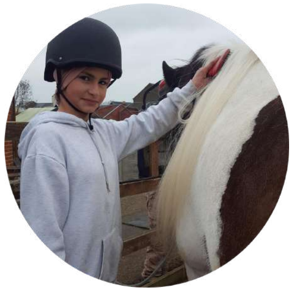
NOAH, NEW HORSE, SPONSORED BY THE SOMNER WILSON TRUST