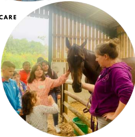
VISIT TO SCRUBDITCH CARE FARM

We have a core team of volunteers at the farm with a wide range of ages and abilities. While volunteers can start from the age of 12, we have been working on engaging younger members of the minority community as traditionally they access the farm for riding but not hands-on farming.