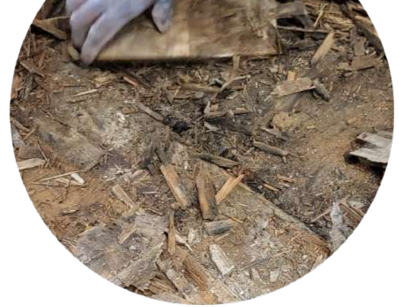
THE COFFEE SHOP FLOOR WAS ROTTEN UNDERNEATH AND HAS NOW BEEN REPLACED