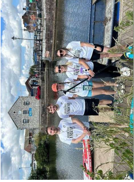
Staff members from the Puerto Lounge