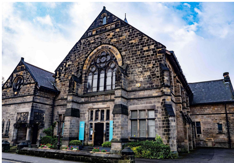
Our office at Vineyard House on Bennett Rd

LCCT has been supporting grass roots community initiatives since 2003. Our unique model enables projects to operate under our charity registration and receive the benefits of shared governance, accountancy, insurance, policies and procedures, HR and operational systems. We also provide development support allowing projects to grow and develop at their own pace within a supportive network of other similar projects. Each project has its own steering group who support the Lead Worker and determine strategy. This ensures that the work is driven at the local level by local people. It means that projects can stay small and operate at grass roots level while funders and other stakeholders can be sure that the infrastructure is in place to manage funds effectively and ensure sustainability. Our 15 projects are supported by a small team of 4 part time staff and 4 Trustees.