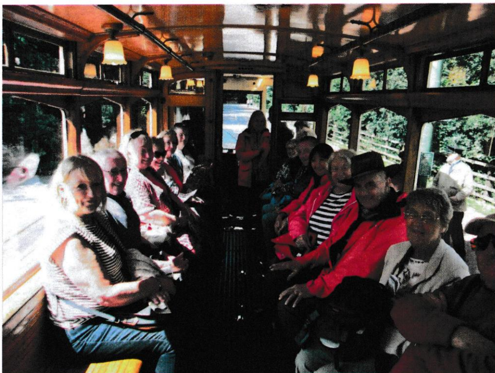
Beamish Outdoor Museum Tram Ride - "Room on top"