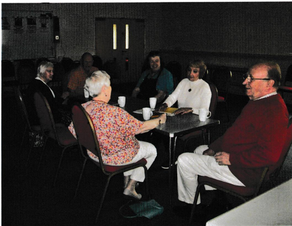
Beneficiary Group Advisory Panel (GAP)