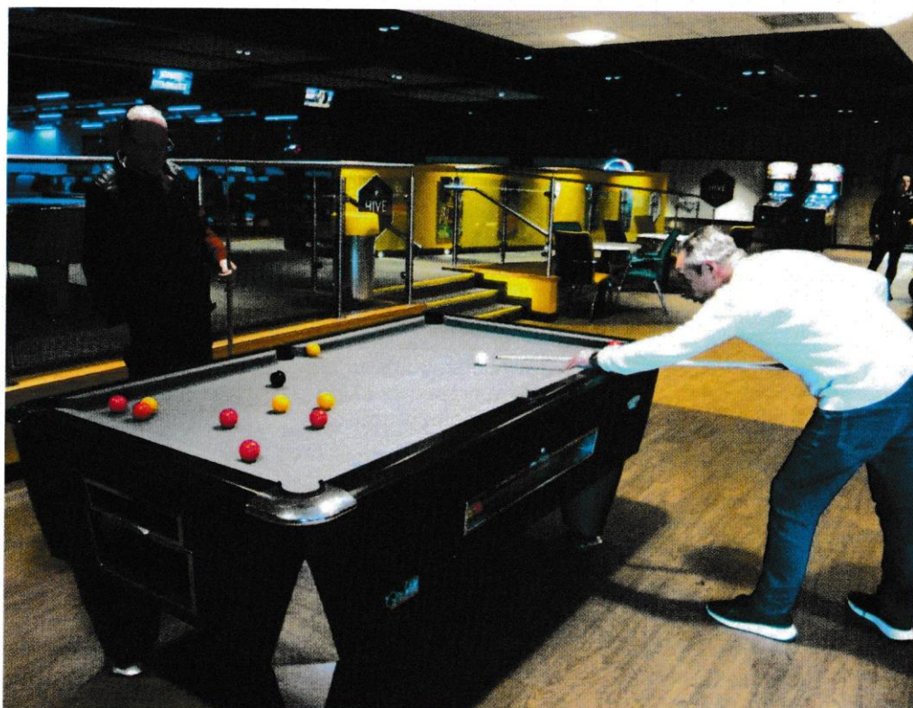
Meaningful Quality Time