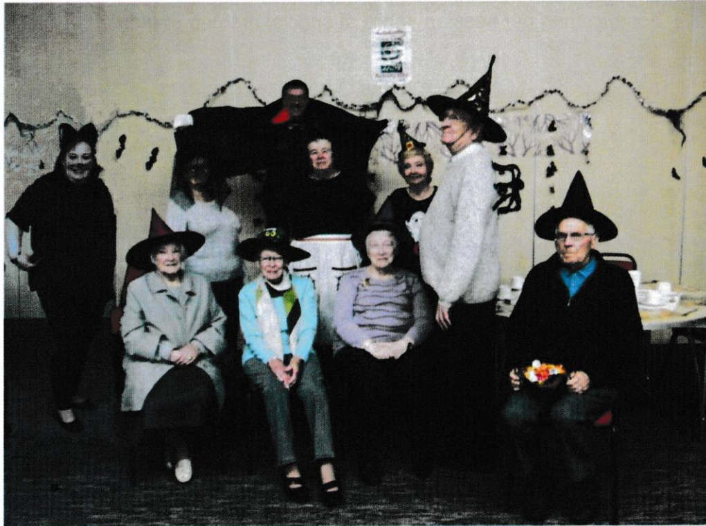
Feelings of Value and Belonging