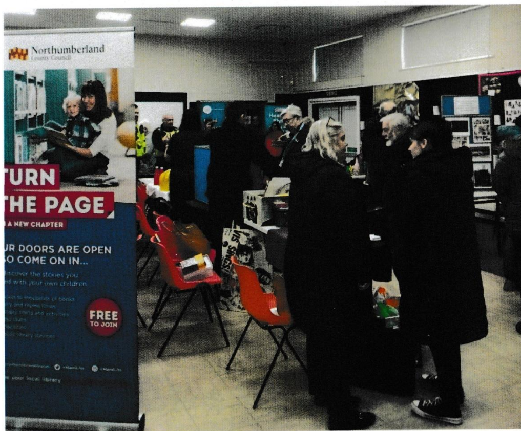
Networks & Partnerships