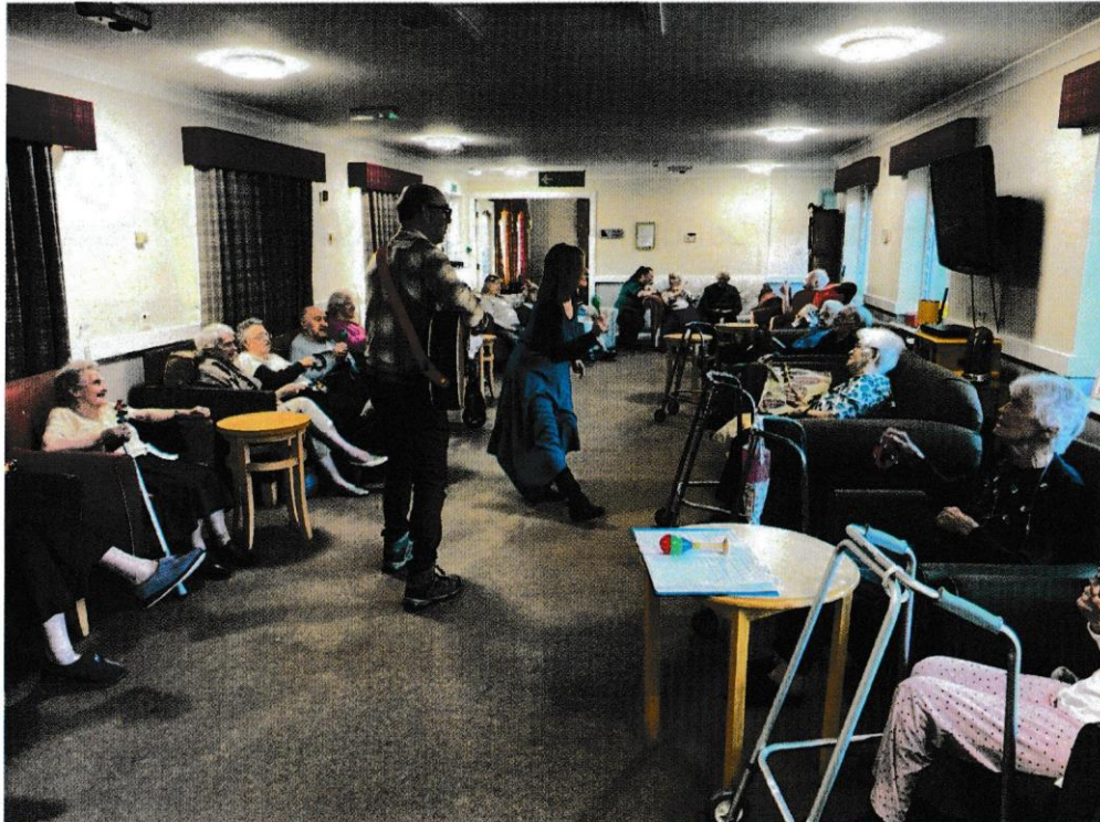
Care and Nursing Home Activities