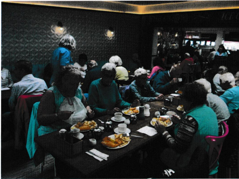
Chair Sharing Quality Time & Fish 'n' Chips with Room Full of Guests