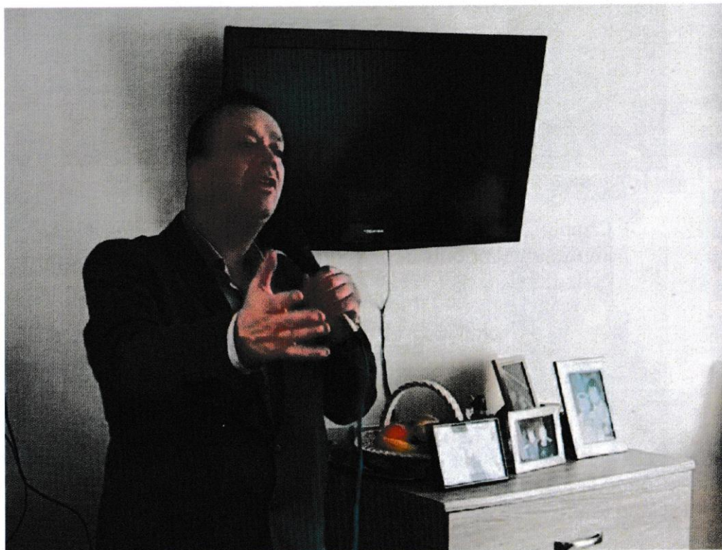
Tailored One-to-One Performances for Bed & Room Restricted Residents

"You all make me feel special and I thank each and every one of you for that" (Client Feedback Jan. 2024)