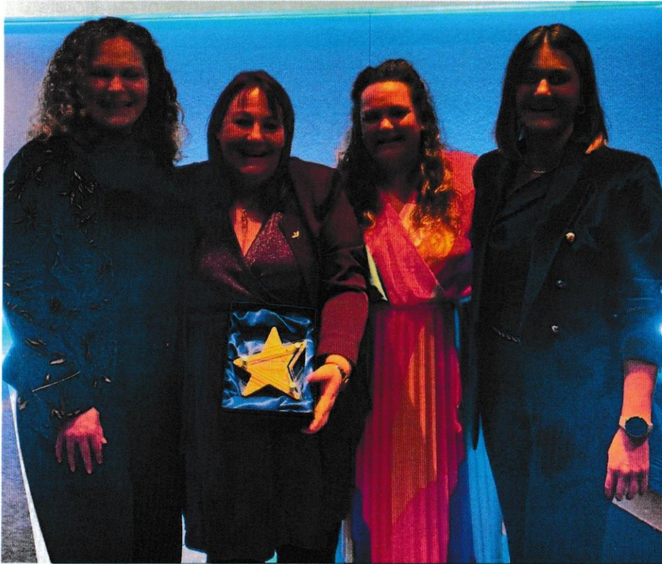
Our Congratulations - Volunteer wins "Time to Shine" to become the proud holder of Newcastle Building Society's "Community Star Award"