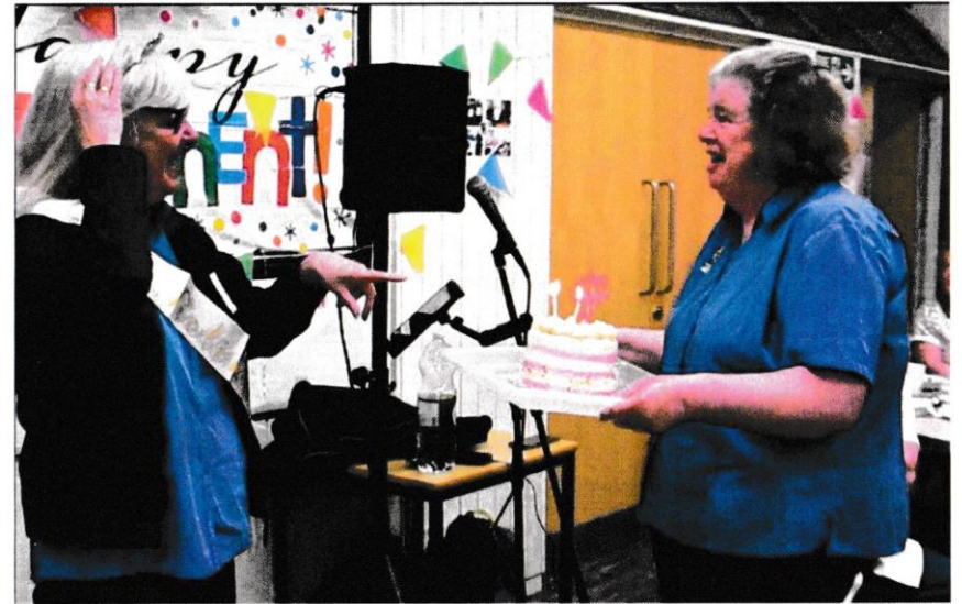
Well Deserved Retirement Thank You Surprise