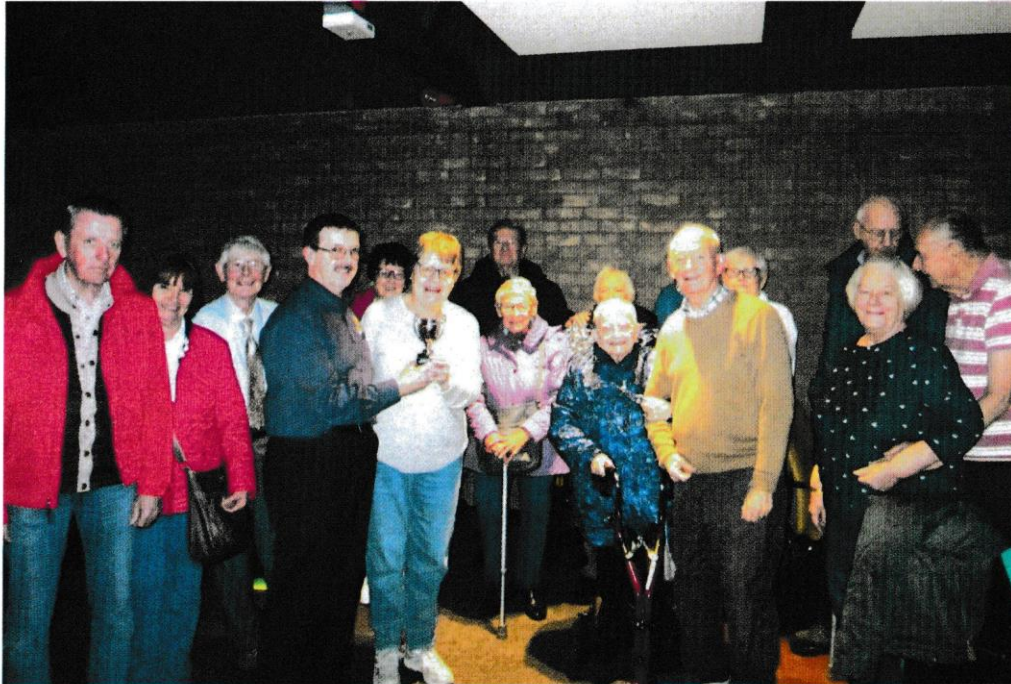
10 Pin Bowling Challenge - Betty Bates Cup