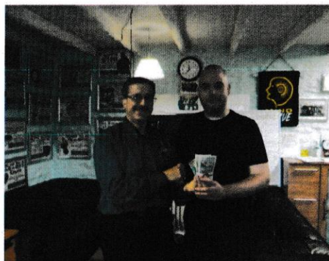
Six - Local Business Charity Night