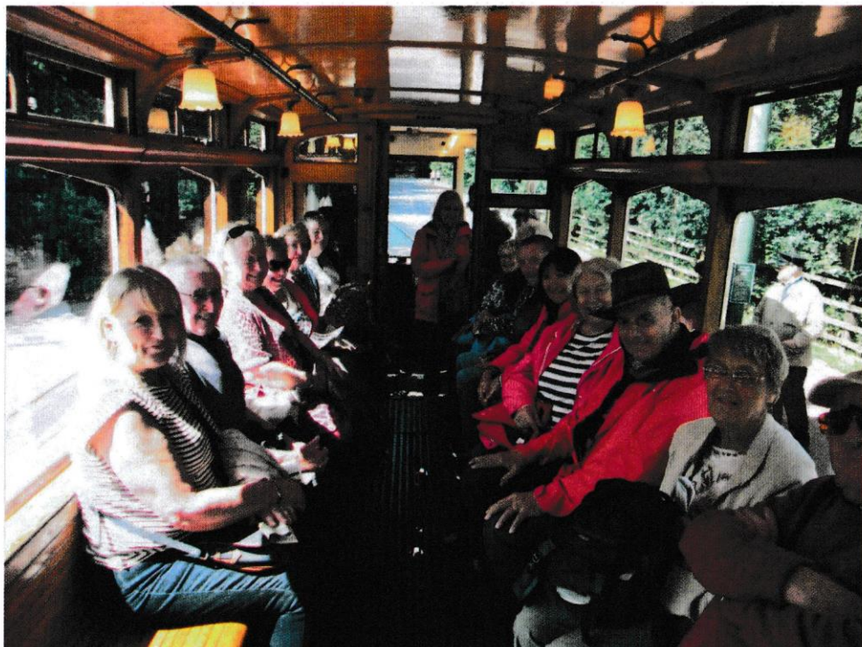
Beamish Outdoor Museum Tram Ride - "Room on top"