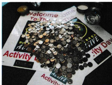
Small Change Collection Jars