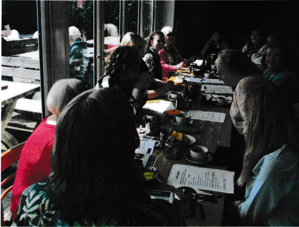
Planning & Development