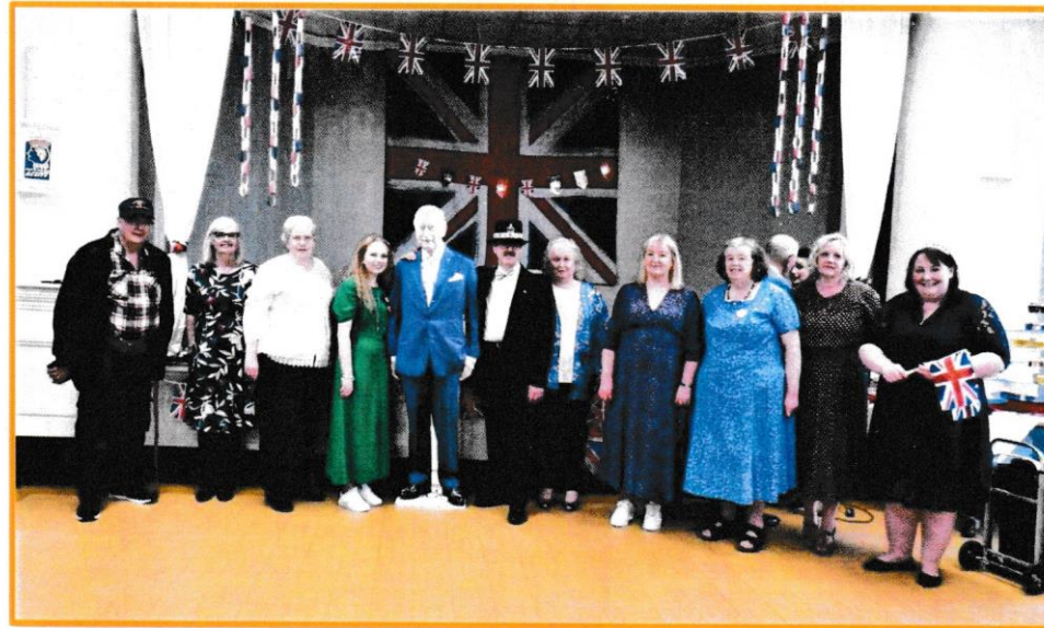
King Charles III Coronation Tea Party Team

"We...shared in the celebrations of the Coronation, where I was even persuaded to wear a dress - an achievement in itself!" (Group Advisory Panel Member & Former Carer. May 2023)