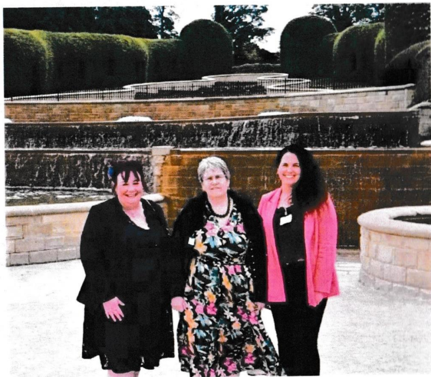
MIND Active Volunteers Attend Annual Duchess of Northumberland Lord Lieutenants Garden Party