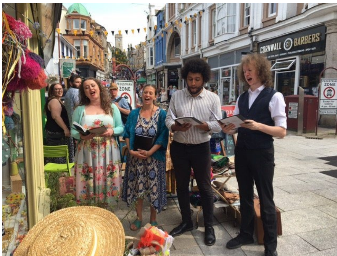
The Story Republic at Redruth Pasty Day