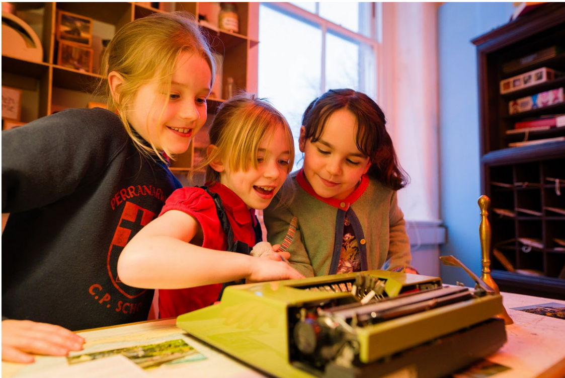
After school club at The Writers' Block.

This funding has also allowed The Writers' Block to deliver additional workshops for care-experienced young people during school holidays, and will support in-depth 10 week programmes from April 2024.