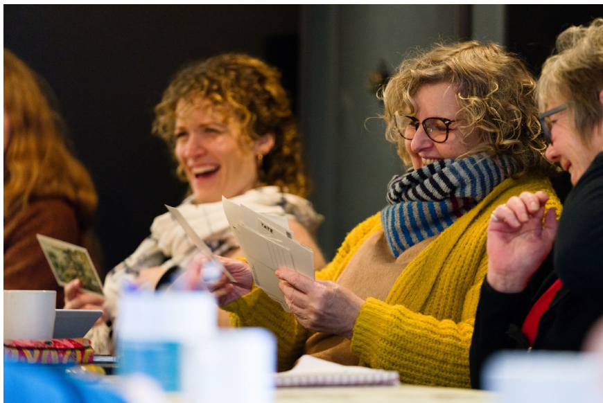
Community writing workshop at The Writers' Block.