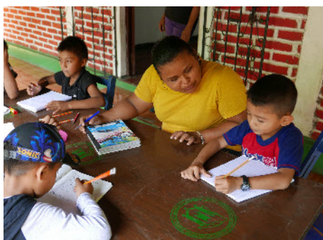
Children receiving educational support at the Feeding Programme

provide them with help for their schoolwork and give age-appropriate lessons in key skills such as writing and maths.