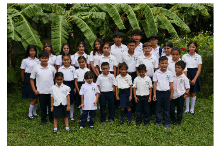
The children supported by SIFT and Hogar de Fe