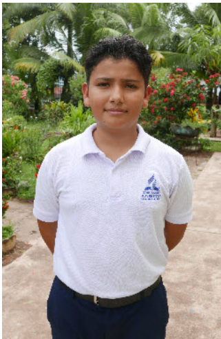
One of SIFT's sponsored students at school

Nicaraguan state schools have been free to attend since 2007, which has made it easier for children from all backgrounds to receive a basic education. However these schools tend not to be fully resourced and can also have large class sizes, affecting the quality of education that the children receive. For those families that can afford it, attending a fee-paying school provides their children with a better standard of education, but this opportunity is out of the reach of the poorest in society.