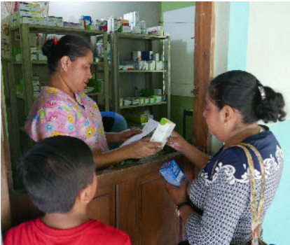
A patient receiving free medicines at Las Pilas clinic

The island of Ometepe in Lake Nicaragua is home to around 35,000 people, most of whom live in rural farming communities. There are limited government health facilities on the island, mainly located in the main towns, and patients who use them need to pay for any medicines they require after seeing the doctor for free. As around 39% of the population of Ometepe live in extreme poverty this means that many people cannot afford the treatment that they need.