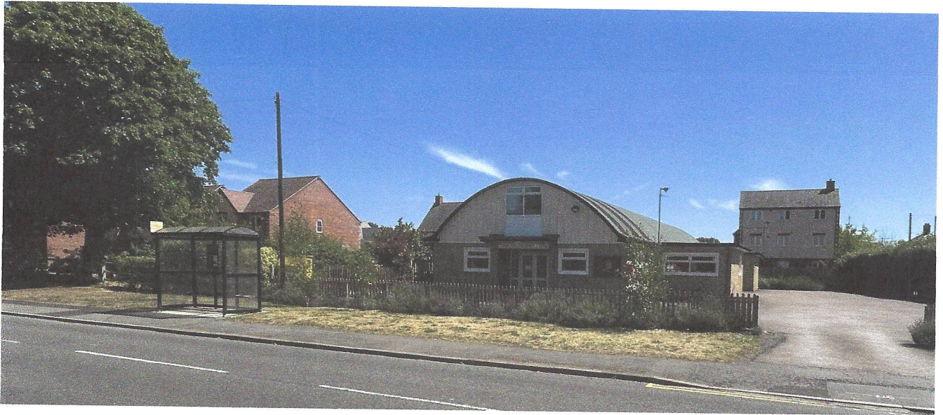
The Tiddington Community Centre