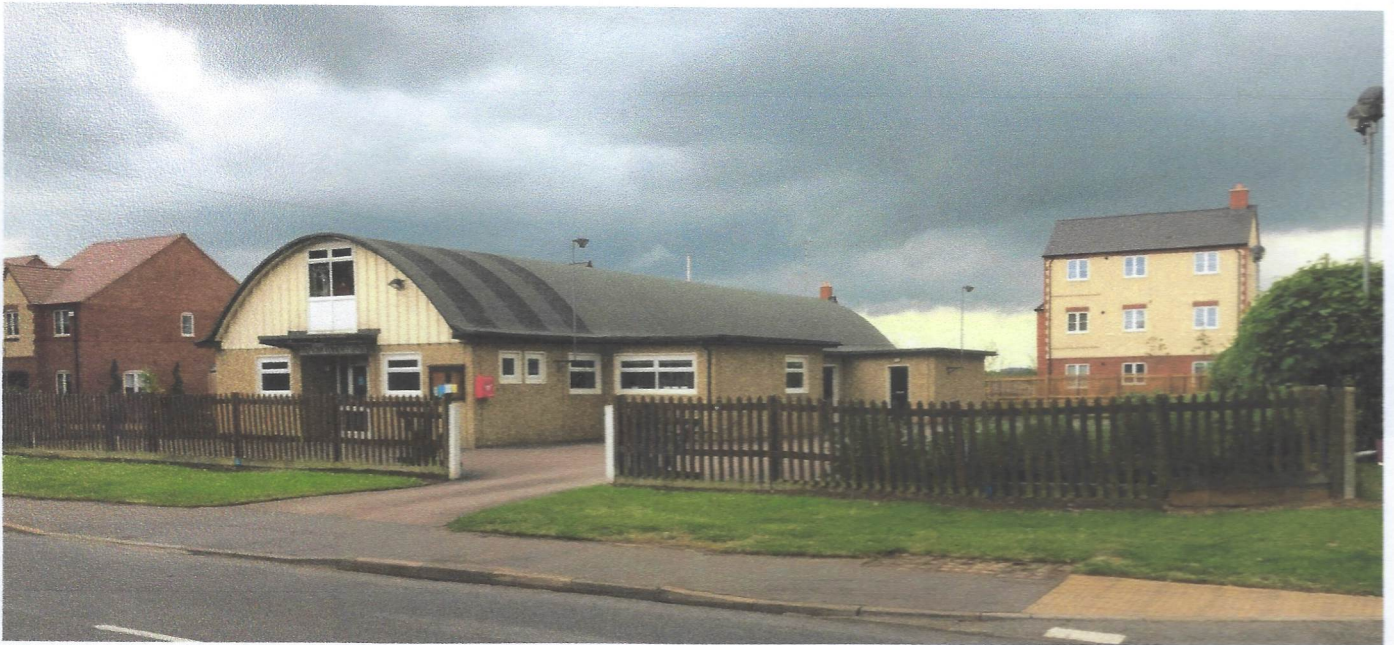
The Tiddington Community Centre