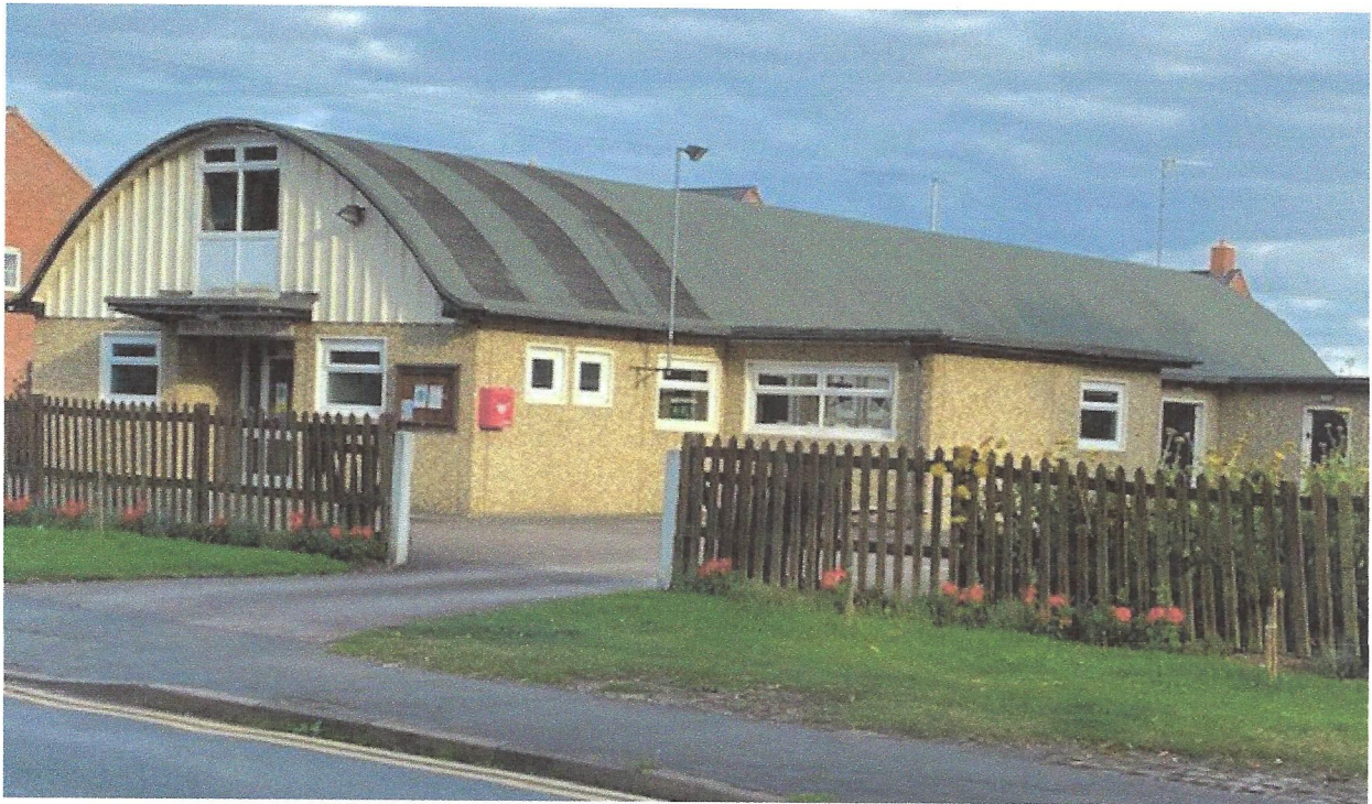
The Tiddington Community Centre