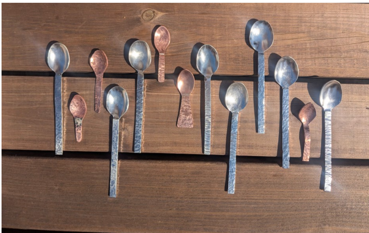
Marlborough College Silver Spoon Outreach Project, May 2025

2025 saw us deliver four sessions to local A level school children which is the commencement of our Outreach activities, made possible due to the new site. It was fantastic to introduce silversmithing to students from Marlborough College, St Edwards Oxford, Faringdon Community College and National Trust Saturday Club attendees. As funds, staff availability and facilities allow we plan to expand this in 2026.