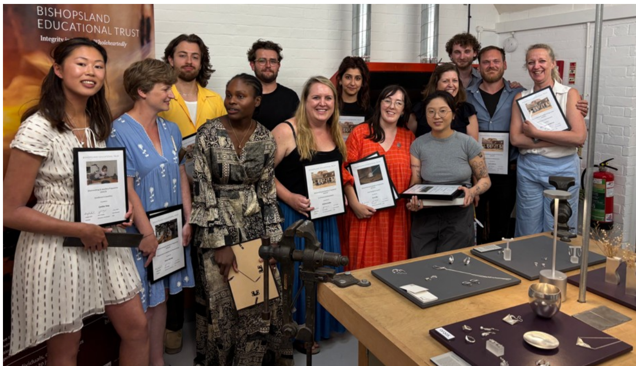
Cohort of 2024/25 receiving end of year Awards at Retro, July 2025

The relocation of the Trust in 2024 to a site within the National Trust's Heritage & Rural Skills Centre in W Oxfordshire marked a significant milestone in the history of Bishopsland. Executing a major refurbishment of part of our new site, moving machinery and tools, establishing new workshops and associated health and safety procedures all took place to budget and schedule. Importantly this allowed us to continue delivering our annual silversmithing programme un-interrupted and we were delighted to welcome a new cohort of twelve makers in September 2024. The ability to continue delivering the programme with no gap or significant delay was a key factor in the Trustee's decision making, as much of our operational income and grant funding relies on the delivery of our core teaching programme.