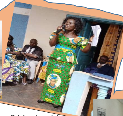
Celebrating of the International Women's Day