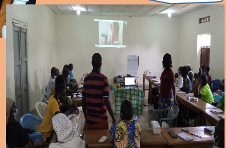
Celebrating of the International Women's Day