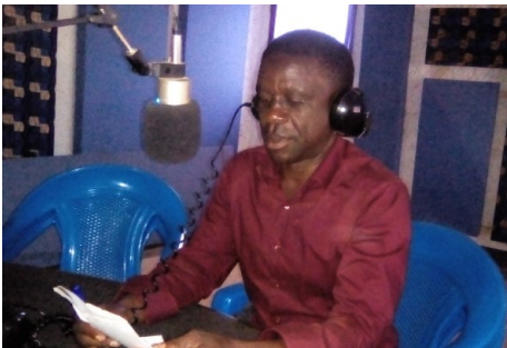
Broadcasting on Health Promotion thematic.