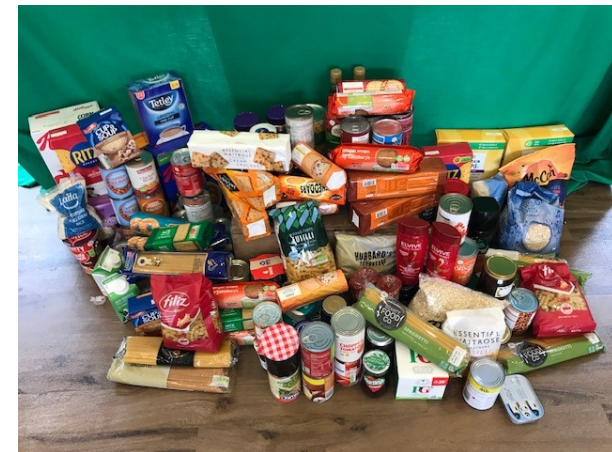
Donations of food items at our harvest service went to the Foodbank.