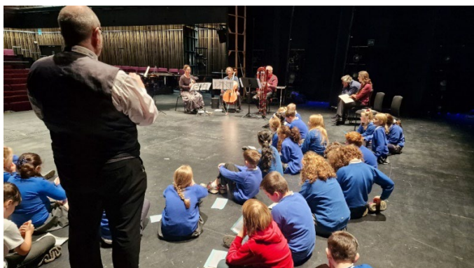
Figure 1 Ysgol Tudno @ Pontio