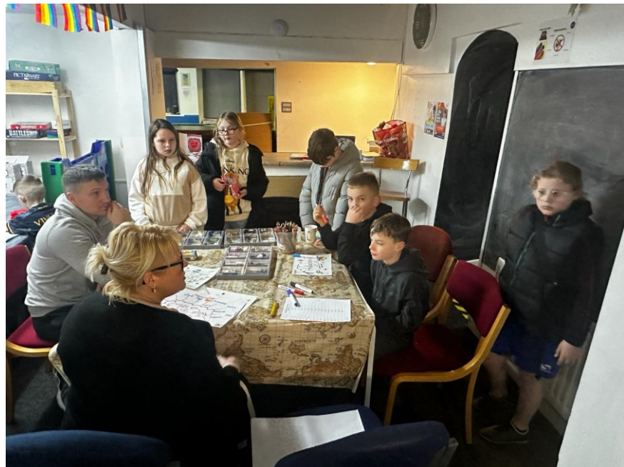
Drug Awareness Workshop

Our regular funding stream for the Friday Night Project, worth £6000 annually, has ended this year, so we will need to try to find alternative funding for this.