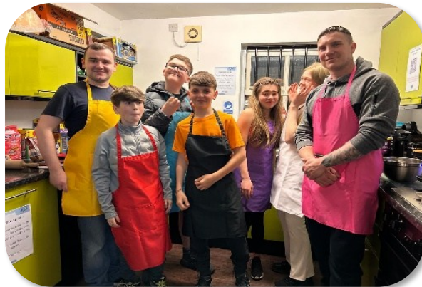
Ready for a cooking session

As in every year, we have had to deal with challenging behaviour from some young people. Some instances of anti-social behaviour were identified by members of the community. We have addressed issues with young people in the Youth Station; alerting them to possible consequences of their actions for both themselves and the wider community and we have addressed relevant issues with targeted workshops. Obviously, this is ongoing work and what we're here for!