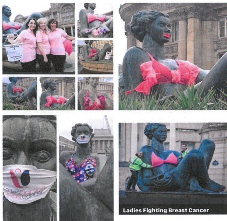
Previous years of LFBC promoting Breast Cancer Awareness in Birmingham

The second city in England had no representation of Breast Cancer Awareness during the month of October 2022.