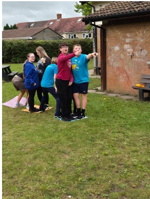
Staff and young volunteers team building day