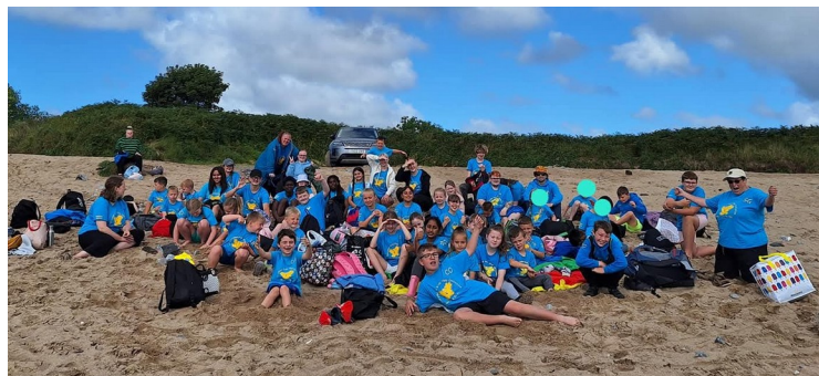
Beach trip always a favourite