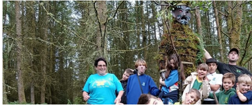
Helping out on Kilvey Hill and having fun