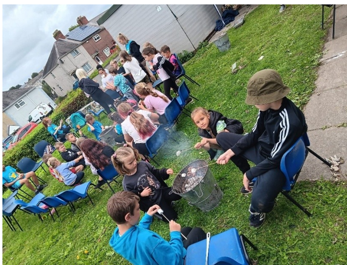
Lots of bbq cooking this year