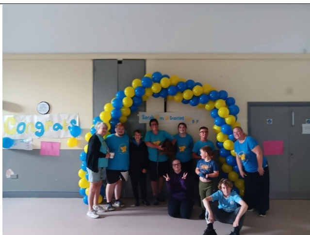
25 Years celebration for our Playleader