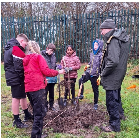
Planting fruit trees for our orchard