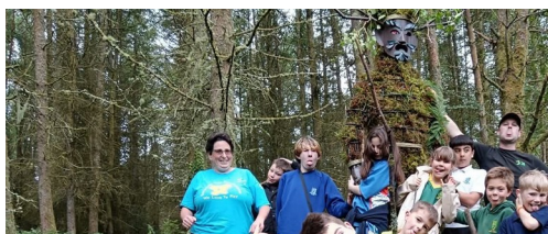
Helping out on Kilvey Hill and having fun