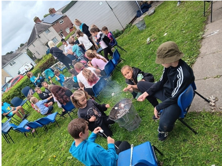
Lots of bbq cooking this year