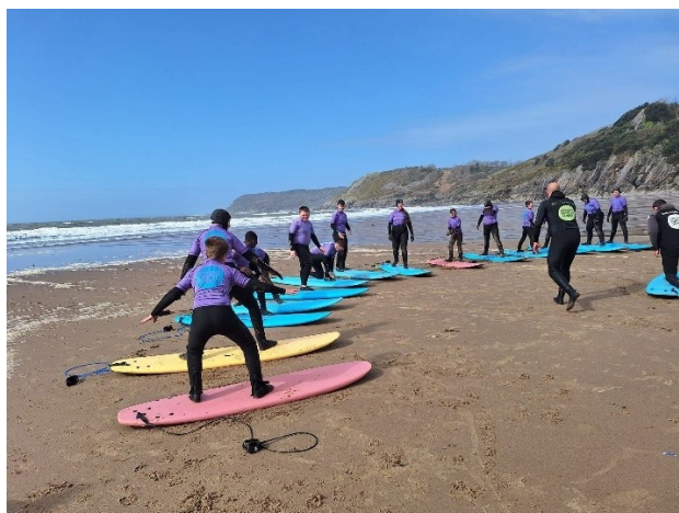
Learning to surf