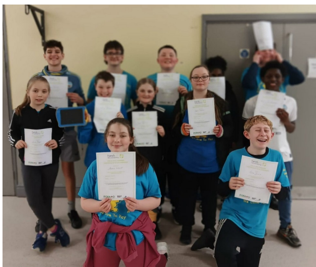
Young volunteers getting 1 st aid qualification