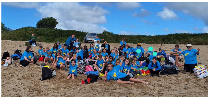
Beach trip always a favourite