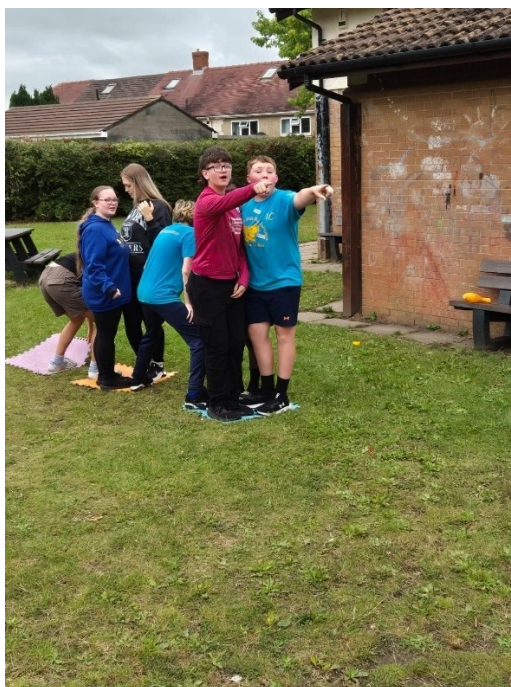
Staff and young volunteers team building day