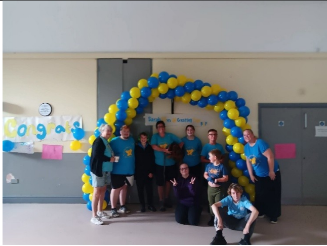
25 Years celebration for our Playleader