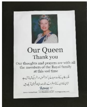
Paying our respect September 2022