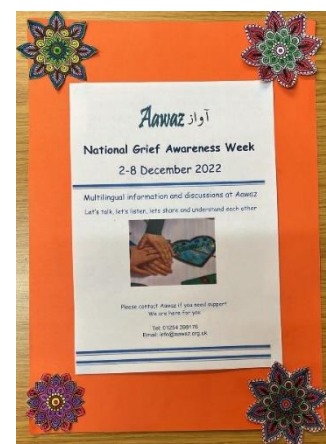
Helping with Grief and Loss Workshops December 2022