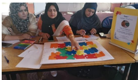
Celebrating Refugee Week June 2022