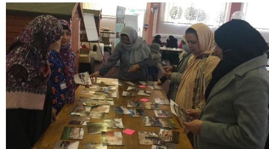
Learning about Heritage Nov 2022