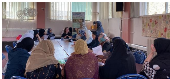
Information sessions May 2022