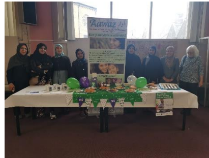
McMillan Coffee Morning September 2022