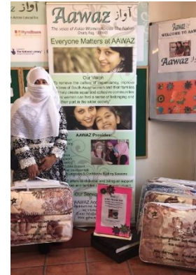
Winter blankets distribution October 2022