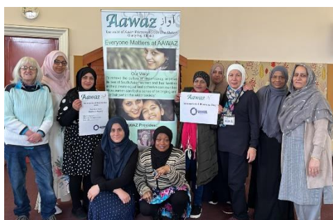
Celebrating International Women's Day March 2023