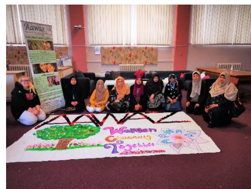
World Together Festival July 2022