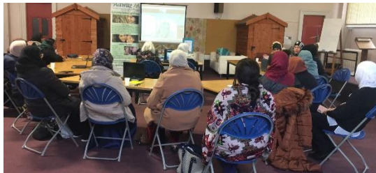
Learning about Gynecological Cancers November 2022