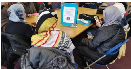
Continuing our Digital skills and Employability programme December 2022