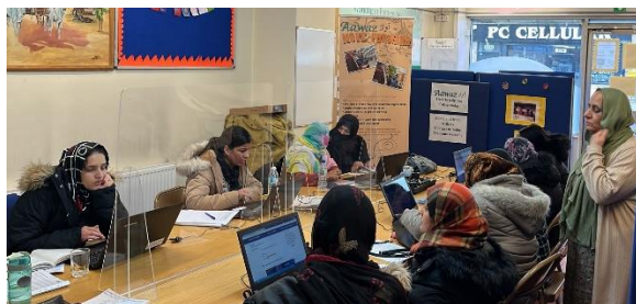
Food related help continued during the year Additional much needed help provided in January 2023