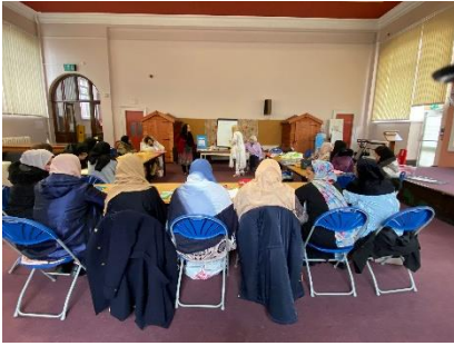
Learning programmes September 2022