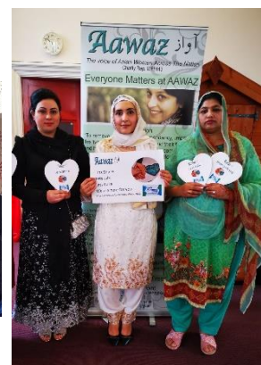
Mental Health Awareness May 2022