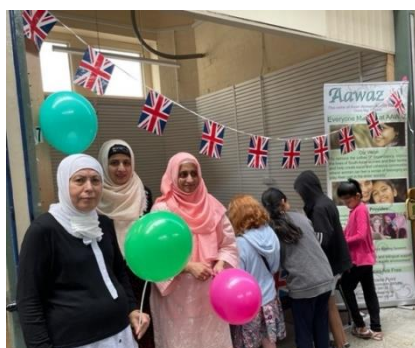
Celebrating Platinum Jubilee June 2022