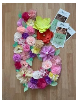
Summer outings & activities