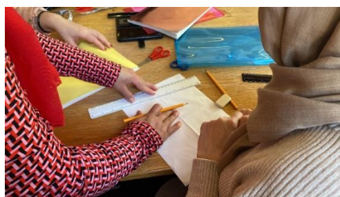
Improving numeracy skills February 2023