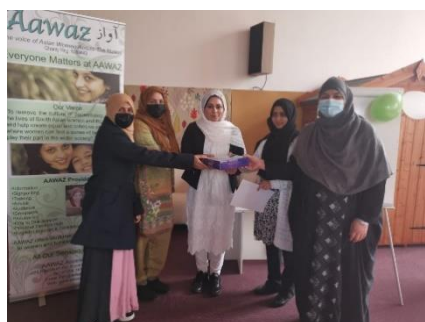
Acknowledging the participant's achievements April 2022