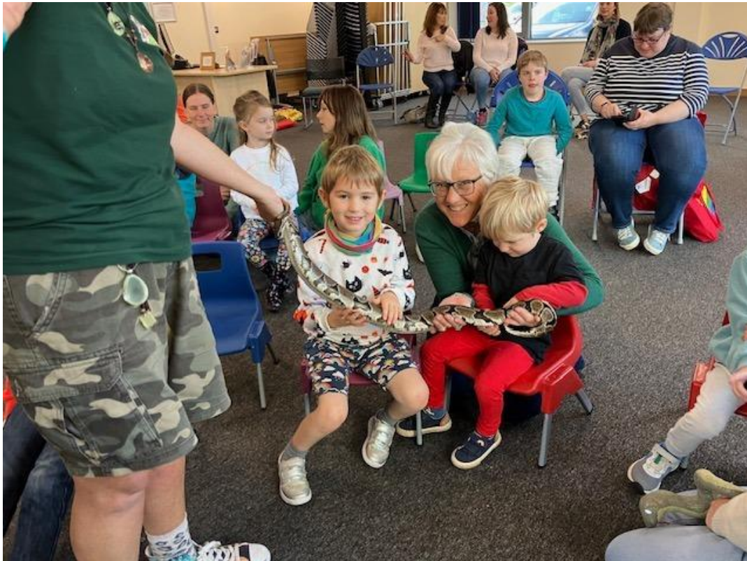
Children enjoying meeting, and learning about unusual animals

Also in 2024/2025, we held our annual Classic Car Show fundraiser, welcoming over 3,000+ visitors and with 252 classic cars on show. The event raised a wonderful £13,500 which was used to maintain Estuary's core services providing care, comfort and support to those in need in our community. We also invested in additional fundraising capacity to raise much needed funds going forward.