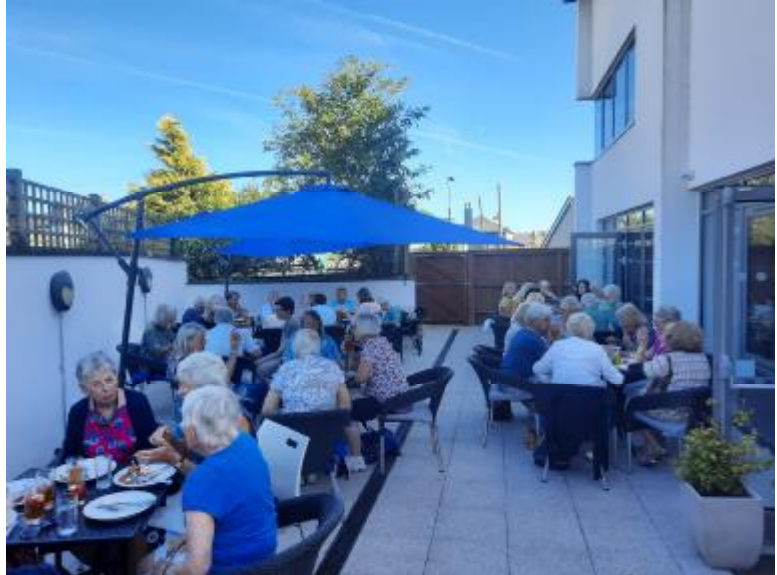
Local people enjoying the Bradbury Café which is open through the week, home to our warm room, as well as a place for special events