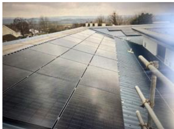
New solar panels installed on the roof of Nancy Potter House