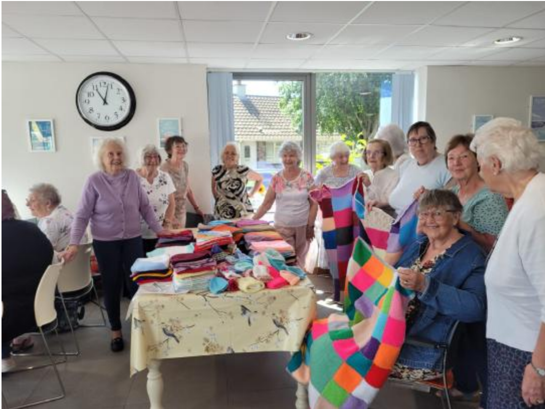
Our Craft Group with their knitted baby blankets and hats which were donated to the Royal Devon & Exeter Hospital