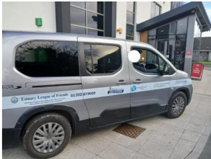
All aboard Estuary's new wheelchair adapted vehicle!