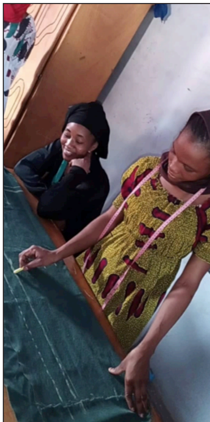
Sewing teaching in progress with young mothers at PAD