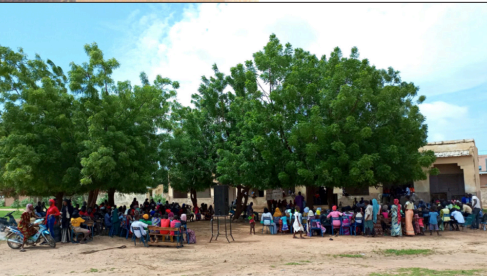
Meeting of participants in Kayes