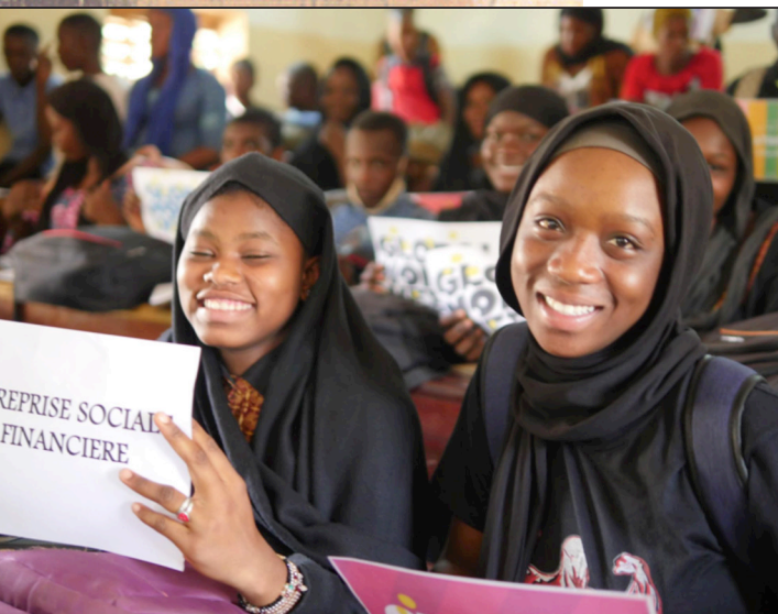
Two young students concentrating on their studies during international money week