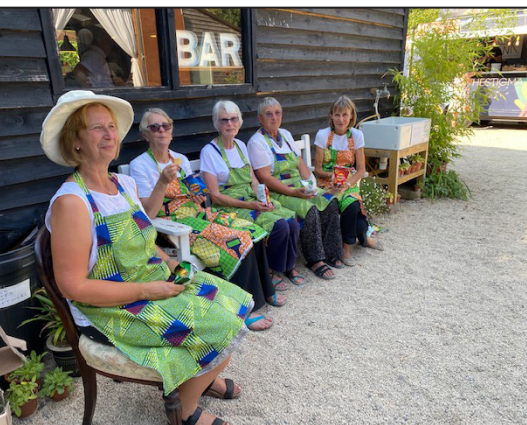
Taking a well earned rest at a wedding reception on one of the hottest days of the year

A local garden which is open by appointment under the National Gardens Scheme uses us to provide the teas. So it gives us a good chance to raise money, have a good chat, enjoy the views and sample the product to ensure it's up to scratch!