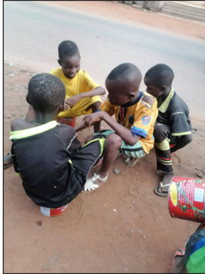
Youngsters on the street in Bamako