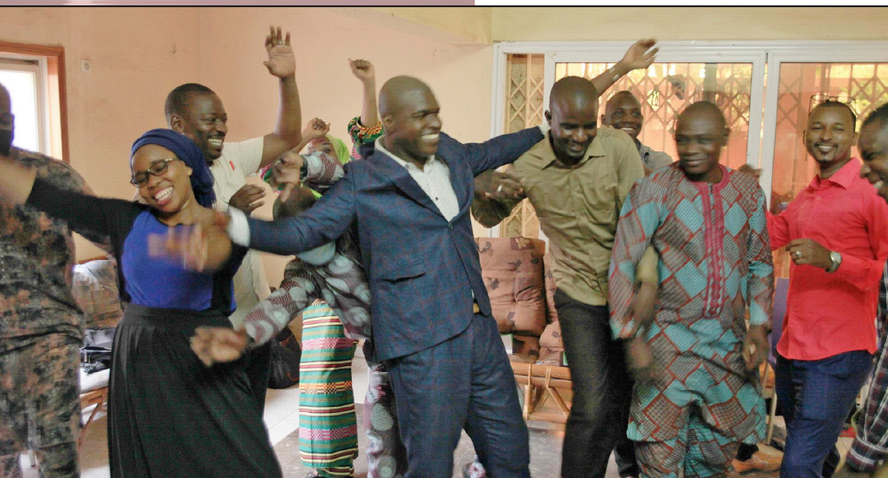
Scene of training of AFLATEEN teacher – facilitators