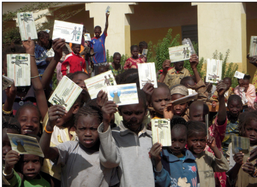
Primary children holding their Aflatoun passbooks

The primary school experience had a number of devoted teachers who held meetings with GAP support, followed annual teacher training and were the first members of the Malian Association of Aflatoun Educators recognised in 2013. Mali's political insecurity - including teachers' union strikes - made it impossible to continue the programme beyond 2018. Teachers tell us they still have children coming to their homes to ask when Aflatoun will start again. Contacts have remained intact between GAP and AMEA association.