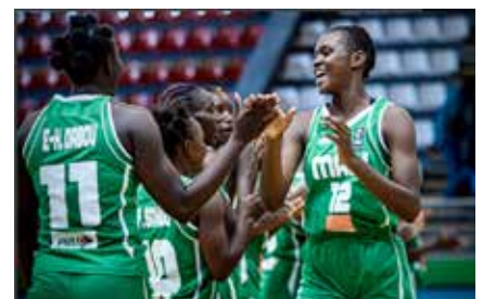
Malian female youth basketball team

In July and August 2021 the Malian male and female youth basketball teams took part in the World Cup and African Cup of Nations in the U19 and U16 categories respectively. The U19 boys finished the competition in 13th position while the girls finished 4th out of 16 national teams.