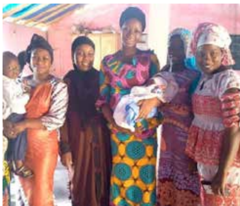
Young mothers - students on PAD's sewing and tailoring course

There have been several unexpected bonuses as well. We have been receiving a year's donated royalties in quarterly instalments via Universal Music for a track on an album by Disclosure which features Fatoumata Diawarra. At a very tight time for all charities this contribution has been really valuable, together with generous sums from several trusts and grant making charities who have been regular supporters over the years.