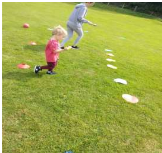
Egg and Spoon race