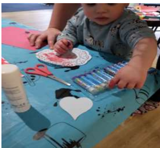
Santes Dwywnen crafts