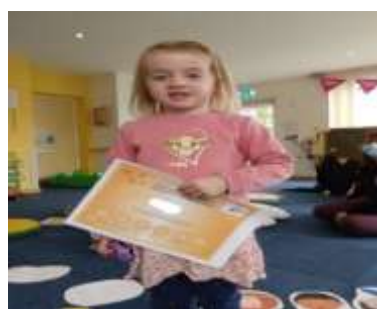
School Readiness Certificate! Well done!