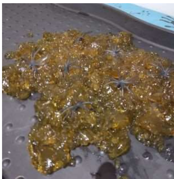
Halloween Messy Bug Hunt