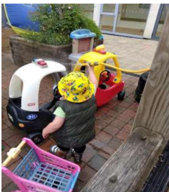
Washing the cars at the Car Wash