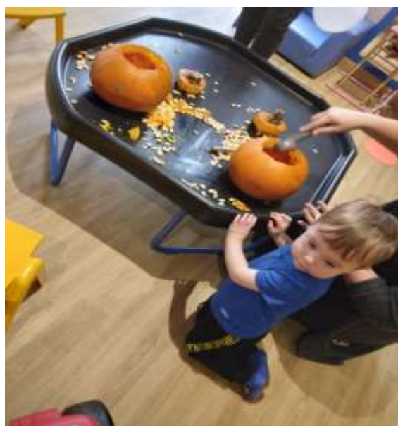
Pumpkin Messy Play