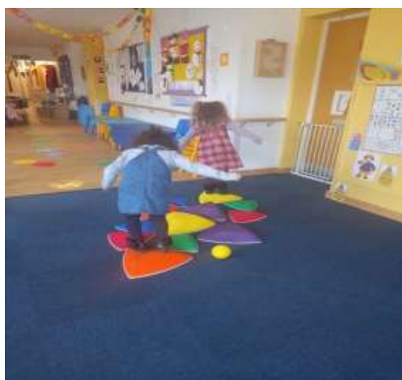
Developing our gross motor skills!