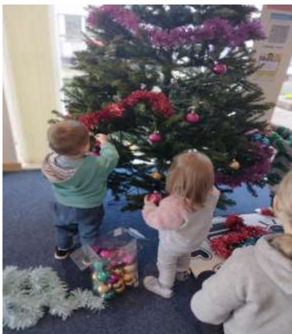
Decorating the Christmas Tree