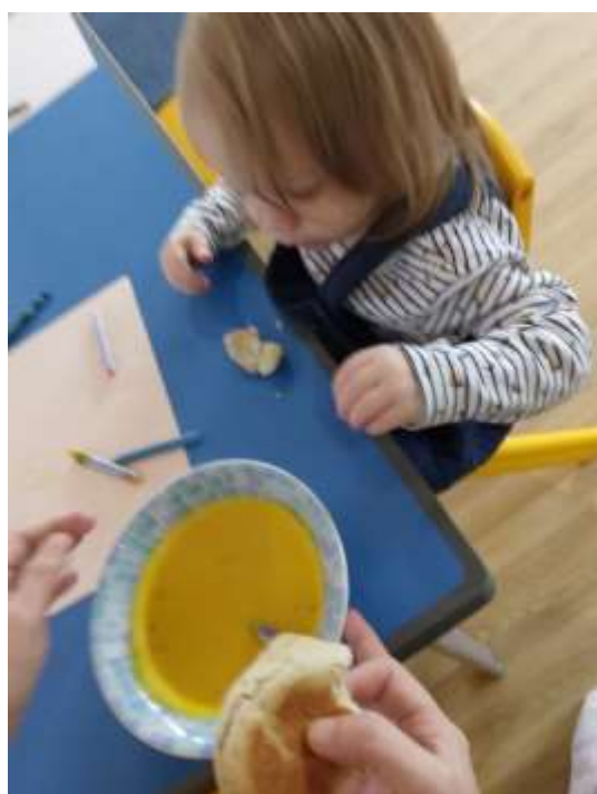
Carrot & Coriander Soup

Children were keen to try the new recipes at the Centre, and parents were surprised that their child was eating certain things that, again, they may not necessarily have otherwise!