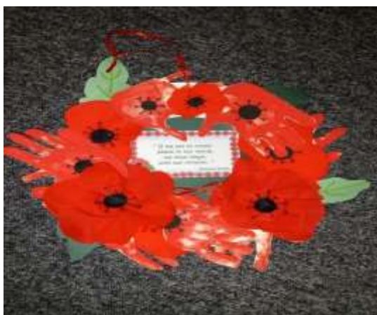
Remembrance Day Crafts