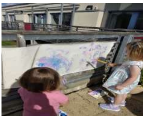
Painting with a spaghetti brush!

Week one focuses on the importance of 'Mark-Making' in the early years, as a precursor to writing. Children's hand muscles need strengthening with a wide range of resources and experiences before they are capable of holding a pencil to write.