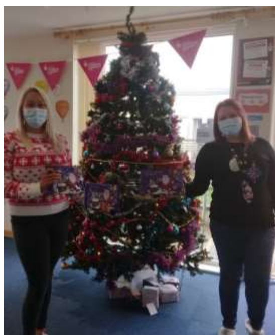
A generous donation of Selection Boxes gratefully received from Dunbia