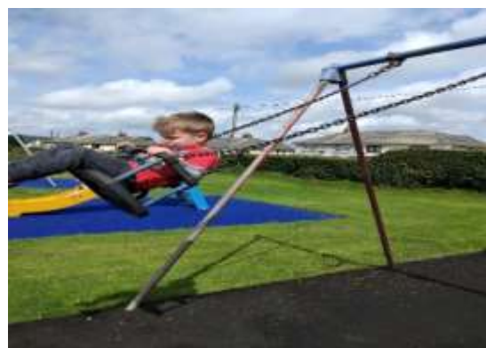
Fun on the swings