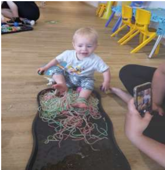
Messy play with cocoa powder!