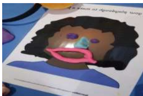
Emotions with play-dough

In week four, we discuss emotional preparation, and give advice and tips on how to manage strong feelings. Participants always receive a certificate for completing the course too!