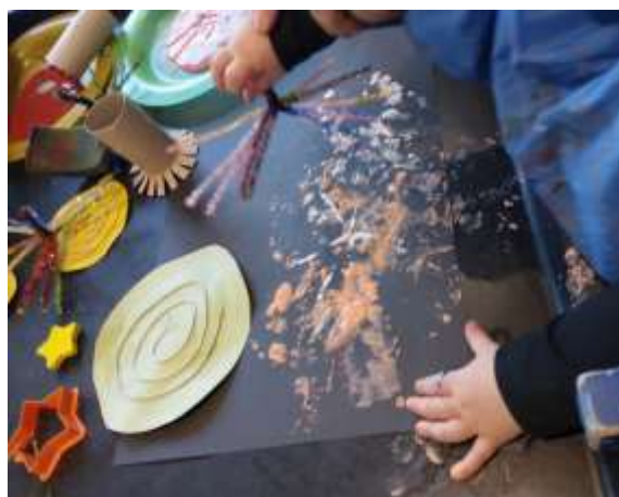
Bonfire Night Crafts