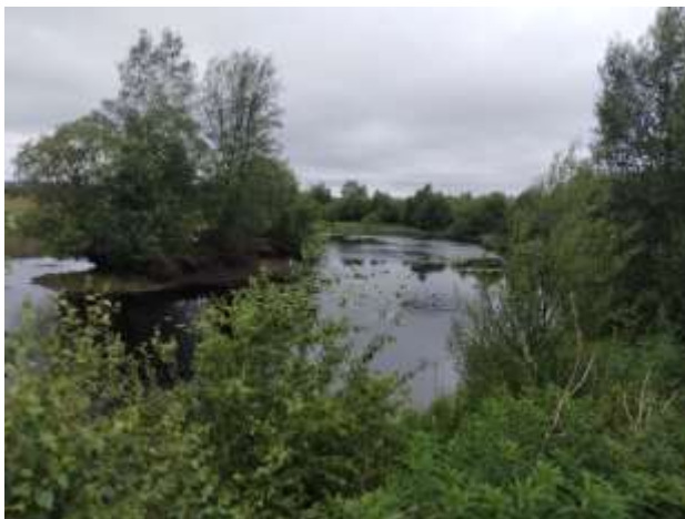
Cors Caron Nature Reserve

Taking families on days out and trips allows them to explore local areas, that they may not otherwise experience. It gives them the confidence to attend, as they know they will not be alone, and also gives the children new experiences.