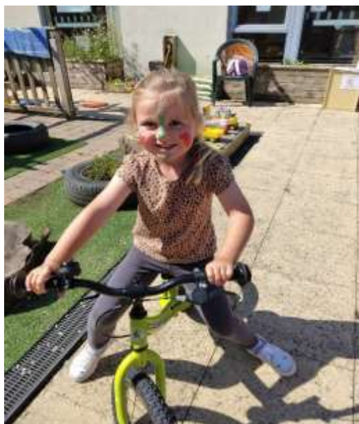
Face painting fun