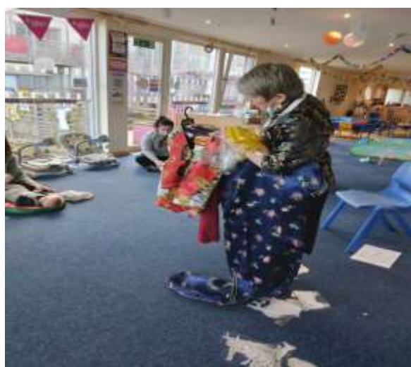
Authentic Chinese clothes and fabrics for Chinese New Year