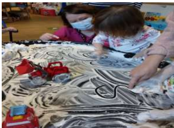
Developing fine-motor skills in the 'snow'!