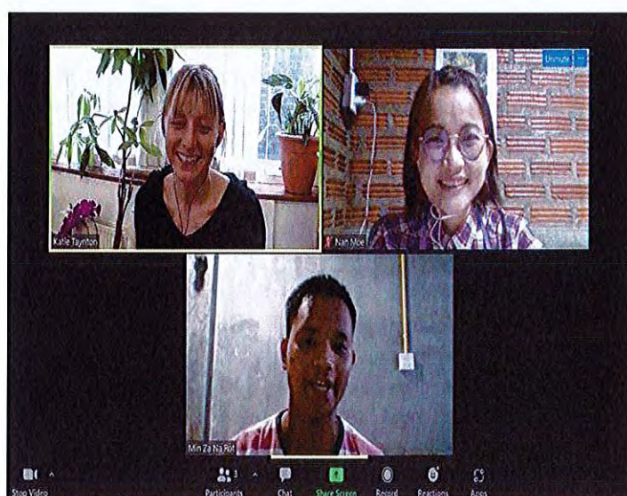
Love and Care Programme