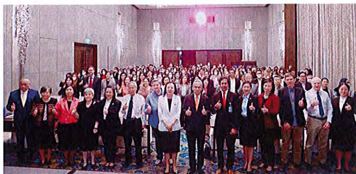
National Alternative Care Conference in Bangkok