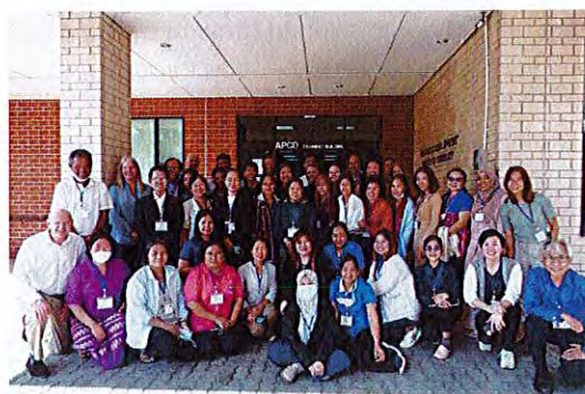
Care Reform Matters Conference in Bangkok