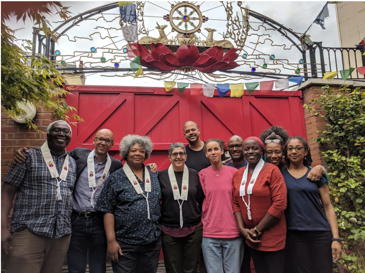
The Triratna People of Colour Group

Currently we work with the other London Buddhist Centres to support London-wide People of Colour activities for our sangha members. Brixton's trustees are also developing a new diversity plan with input from the London Buddhist Centre's Mindful of Race Group, and our involvement with the European Chair's Assembly Diversity Group. We hope this initiative will offer more pathways into our community for people of all ethnic groups, as well as offer specific support for People of Colour to deepen their Buddhist practice within our community.