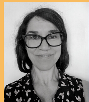
ELENA Online Events Coordinator