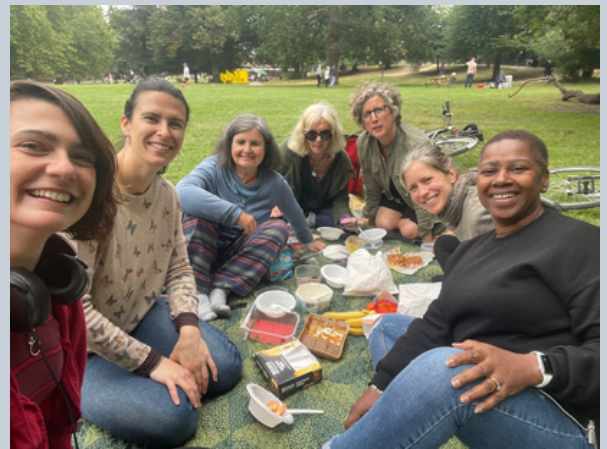
One of our women's study groups. (Some of our groups meet online and some in-person)

However, at Brixton we offer the first year of this programme to anyone who would like to deepen their understanding of Buddhism and Buddhist practice. If you are interested in joining a study group, then speak to an Order Member at one of our classes.