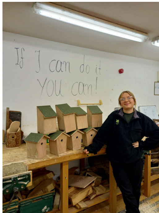
Bat & Bird boxes (created in Woodwork by our clients)