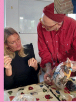
Our Art Therapy Sessions