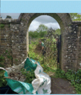
Garden Work Parties: National Trust Sheffield Park Partnership