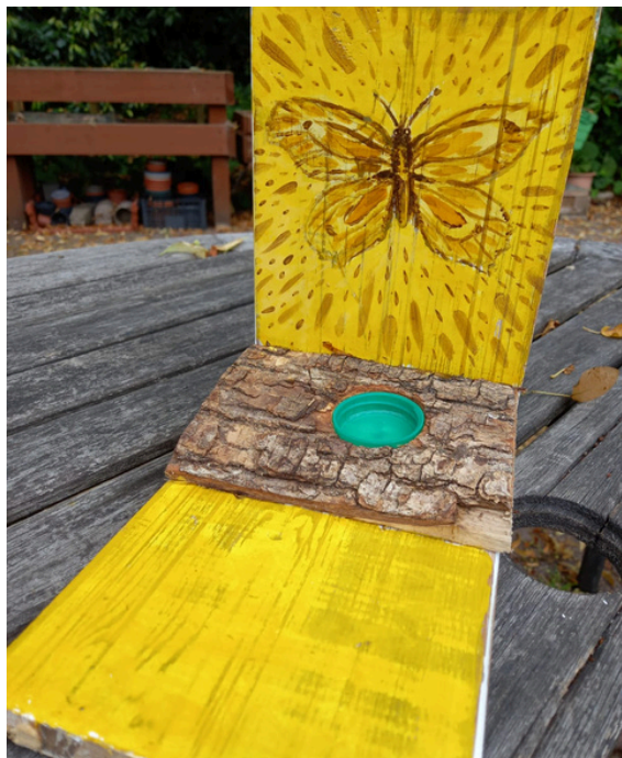
Butterfly feeders (created and painted by our clients)