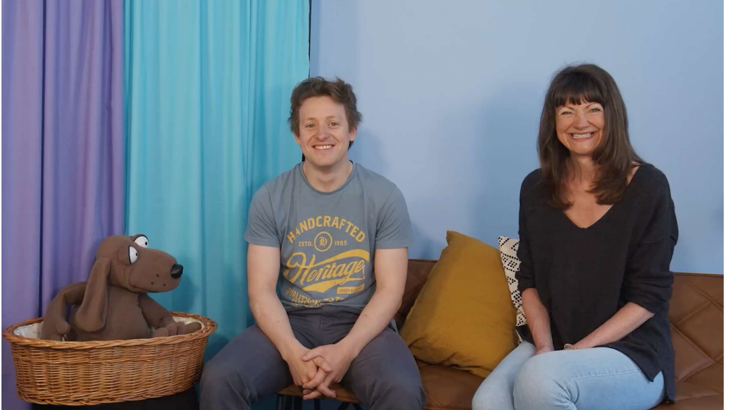
'United Breaks Out' 2021 Children's content