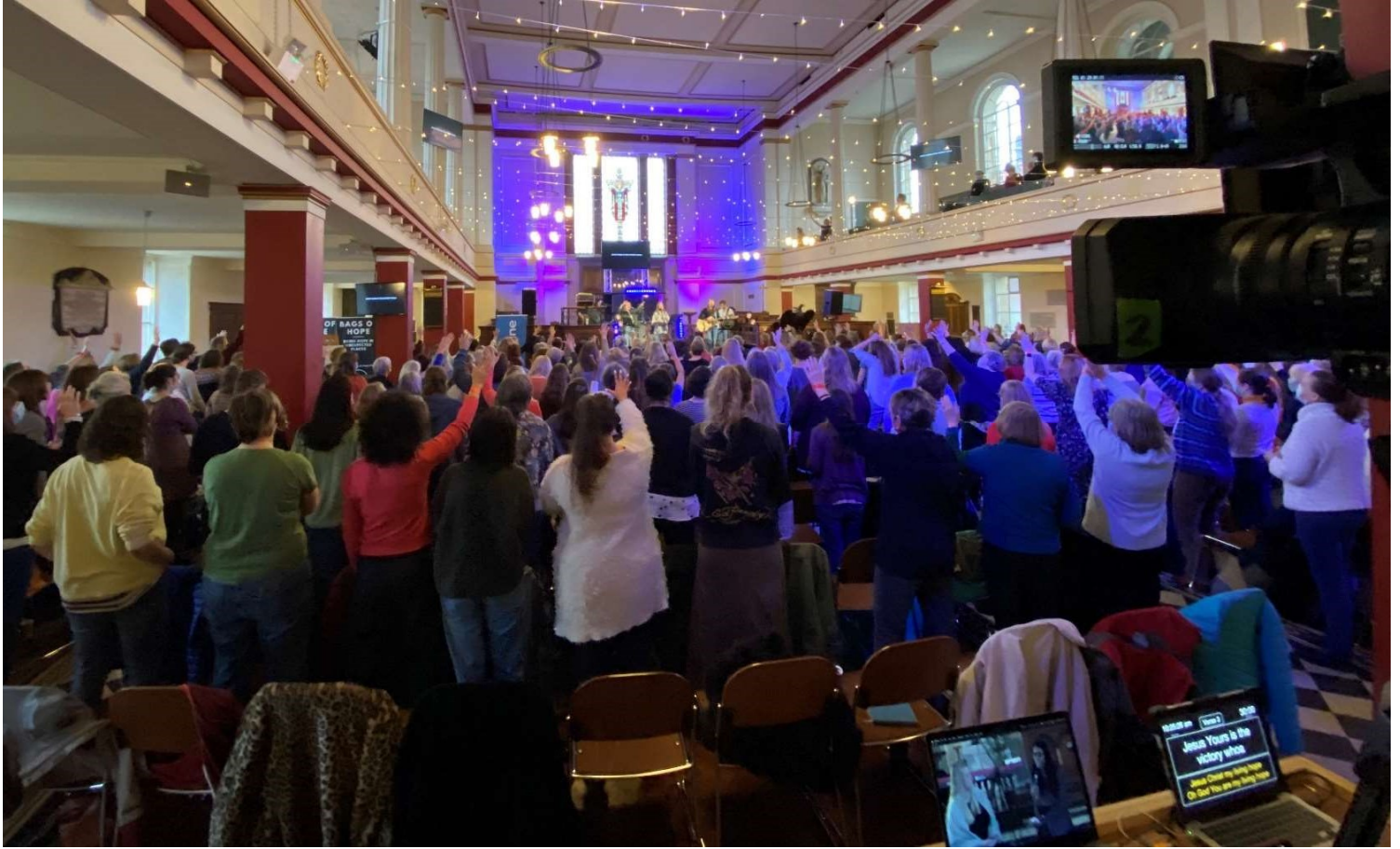
'Reset' Women's Day, 2021

The church leaders' network continues to flourish with over 2,070 active members; New Wine is providing invaluable support to local church leaders in their own contexts through the local area network groups as well as networking opportunities at larger conferences or gatherings.