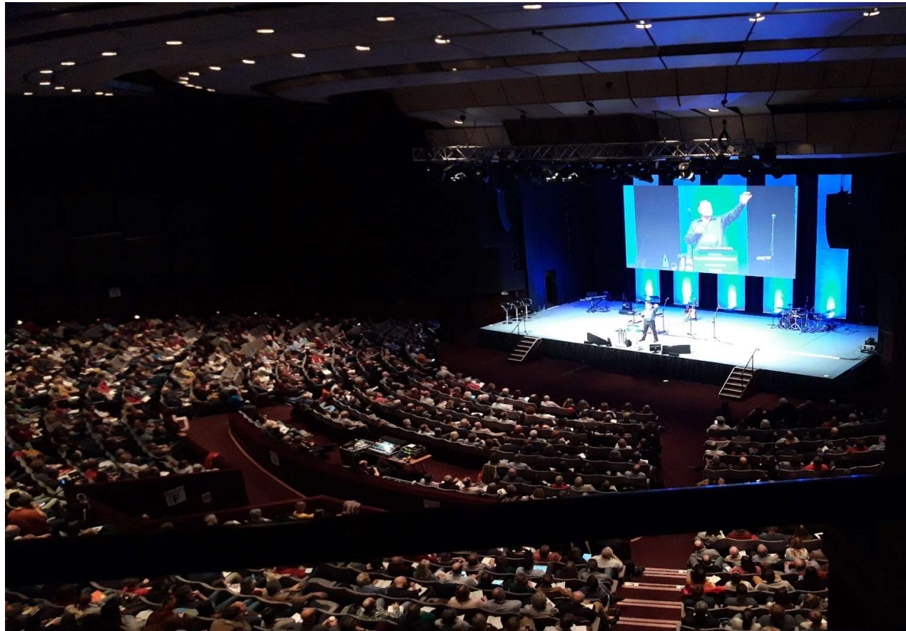
National Leadership Conference – Harrogate, March 2020