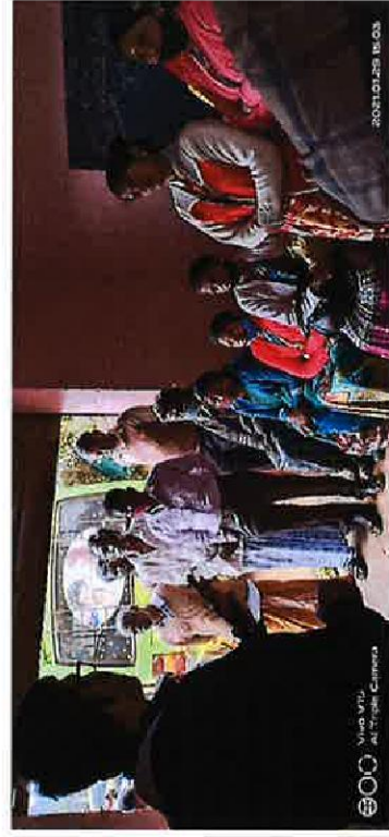
Above and below: HIV stigma 'workplace' awareness meetings