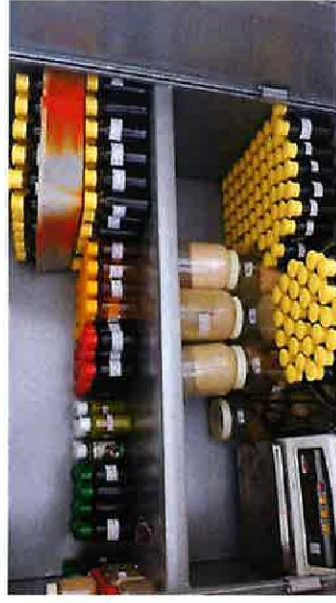
Products made by the VHOs

People trust the decoctions given and feel they work.