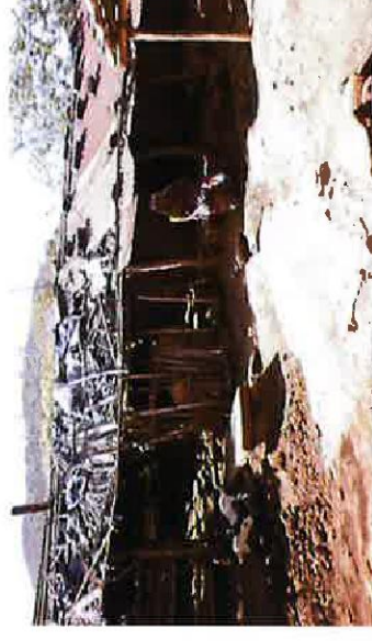
A typical example of poor housing in the region

During the COVID lockdowns day workers have been laid off, resulting in massive reductions to family income. Those not in possession of food ration cards will be a focus of our attention during 2022. People with HIV are struggling for survival, having no support from their community, nor from employers.