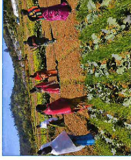
The governments department of horticulture sent 30 farmers from Godalatty village to gain confidence in conversion to organic farming. They saw and learned about a compost, slope management, multicrops, azolla cultivation, vermicompost etc.