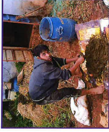
Panchagiya preparation for farmers and staff

World Soil Day was celebrated in December by invited Organic groups and hosted by the new collector and Dept. of Horticulture. The theme was boosting soil productivity and raising awareness of the importance of maintaining a healthy ecosystem for well-being. GoHT presented to a group of selected organic farmers from throughout the district. This was quite a high-profile event and provided a good opportunity to brief the audience on how excess fertilizer and pesticide affects both quality and productivity whereas organic/biodynamics plays a much more important role in rejuvenating the soil and improving soil productivity. We also exhibit at various shows and conventions whenever possible as this is a good way to showcase the quality of organic produce.