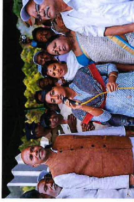
Below, The Collector speaking at the end of the organic rally in Ooty during the year.