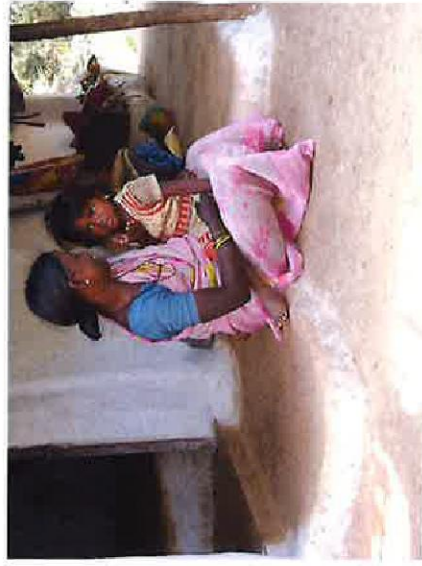
Irulla mother and child