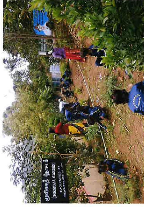
Kesalada school medicinal plant garden