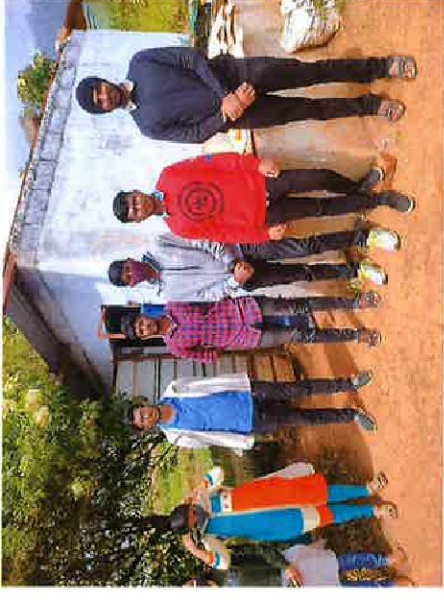
Below: Before COVID lockdown -students at Garikur village school telling us about the medicinal plants to be found around their village.

It looks like the school village eco club programme won't re-start until late 2022 or at the start of the new academic year in June 2023, due to COVID, the time it takes to receive the necessary approvals from the education minister and of course the school headteachers. But in the meantime, internships have been offered to students from Karunya University (school of agriculture and applied sciences) and Tamil Nadu Agricultural University. These internships provide practical and theoretical programmes over one month with nursery visits providing an introduction to basic organic skills – seed treatment, sowing and planting, how to prepare Panchagavia and Jaavamritham, bio-dynamic composting, vermi-composting, slope management, soil and raised bed preparation, intercropping and harvesting. Prior to COVID GoHT hosted an annual visit from students from Cornell University and it is hoped that this association will be restored when the pandemic is over.