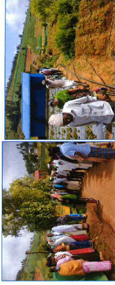
Farmers from MelKowhatty village visit Thambatty for guidance

At the beginning of the lockdown some produce was given to HIV clients, with only a fraction sold at a central market at vastly reduced prices. The pandemic means we need to take a fresh look at how the benefits of having model farm can be managed and several ideas are being considered as we write this report.