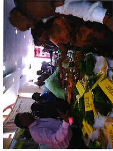
Before lockdown: The Collector visiting the GoHT stand at an Organic conference in Ooty