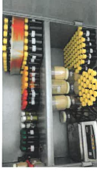
Products from the self-help group, Mullai:

People trust the decoctions given and feel they work.