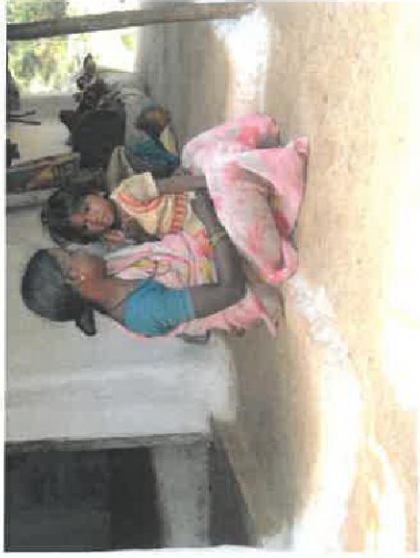
Irulla mother and child