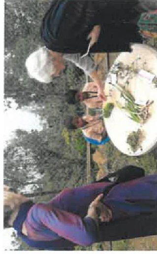
Above students at Pudur school

This programme has been put on hold from March 2020 as a consequence of COVID but planning for its restart is in our minds as it is seen as an important way to nurture future generations. These pictures were taken two years ago.