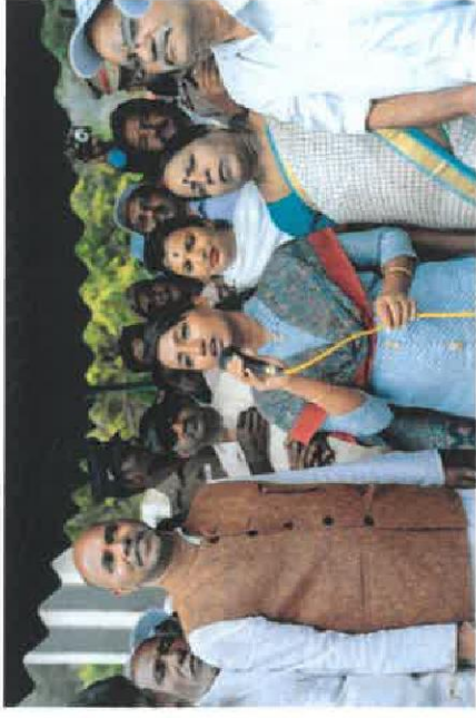
Below, The Collector speaking at the end of the Organic rally in Ooty during the year.