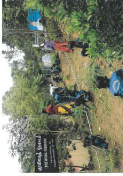
Kesalada school medicinal plant garden