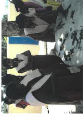
Above: students at Garikur village school telling us about the medicinal plants to be found around their village.