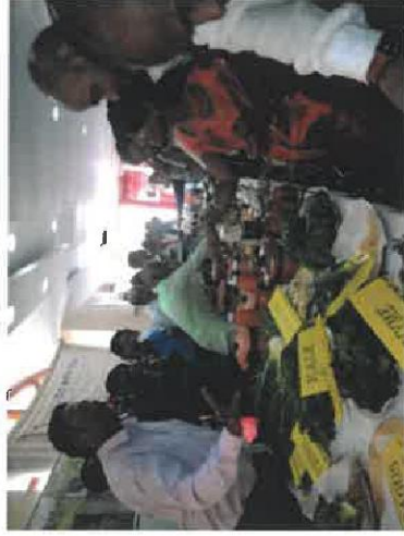
Before lockdown: The Collector visiting the GoHT stand at an Organic conference in Ooty