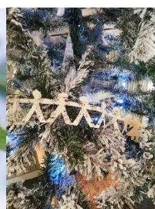
Spring 2021, Summer 2021 and Winter 2021/22 Newsletters