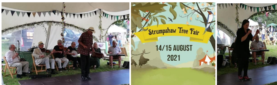
Strumpshaw Tree Fair with Hushwing band and East Anglian Stepdancers organised by EATMT

Stepdance Day , traditionally taking place in July, was another lost event due to uncertainty of exactly when we would be out of the various tiers. In spite of this, we joined the brave Strumpshaw Tree Fair who planned for their weekend event a month later than their usual date and arranged for Norfolk musicians – Hushwing - and a variety of stepdancers to showcase East Anglian Stepdancing which took place in August.