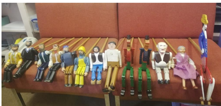
EATMT's set of jig dolls

The Trustees are pleased to report that the charity's internal financial controls, in particular, conform with guidelines issued by the Charity Commission.