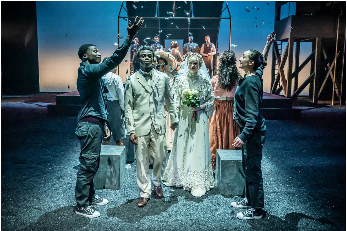
Our Town, autumn 2022