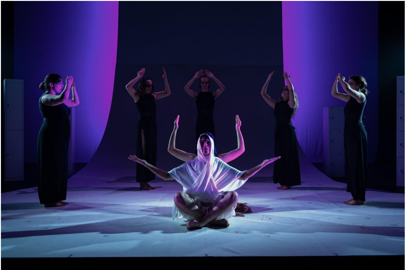
Dance Nation, spring 2023