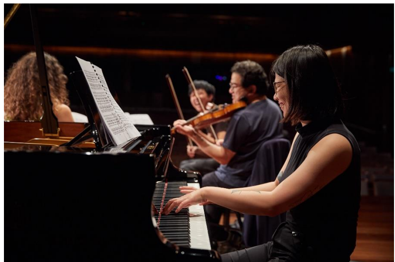
Chamber Music Festival, autumn 2022

A grant from the Cosman Keller Art and Music Trust in support of chamber fellowships continued to provide an invaluable development opportunity for a young professional group, with a base at the School, to be inspired by Guildhall's world renowned chamber music professors, and in turn to inspire current students through performances and seminars.