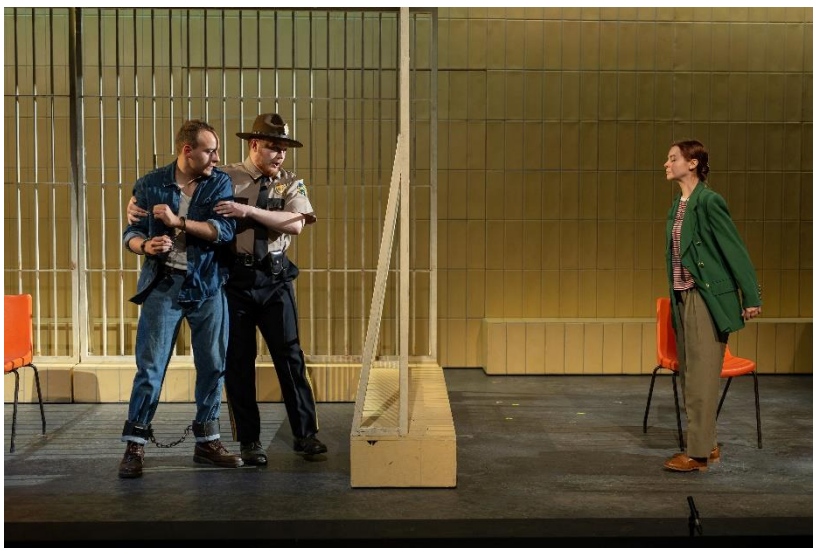
Dead Man Walking, spring 2023

A grant from the Dow Clewer Foundation supported scholarships for postgraduate opera singers.