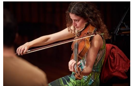
Chamber Music Festival, autumn 2022