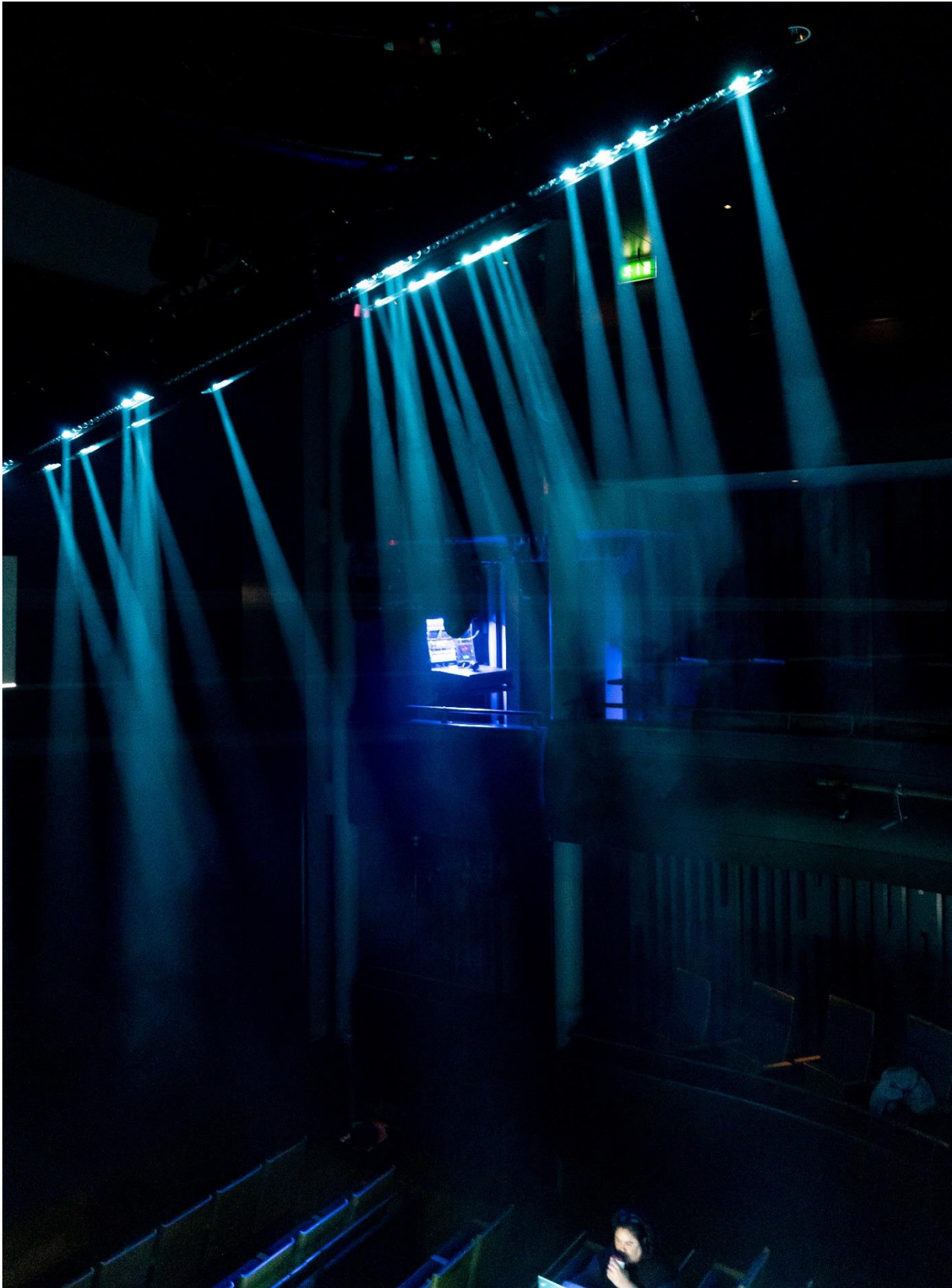
Moving Screens, spring 2023