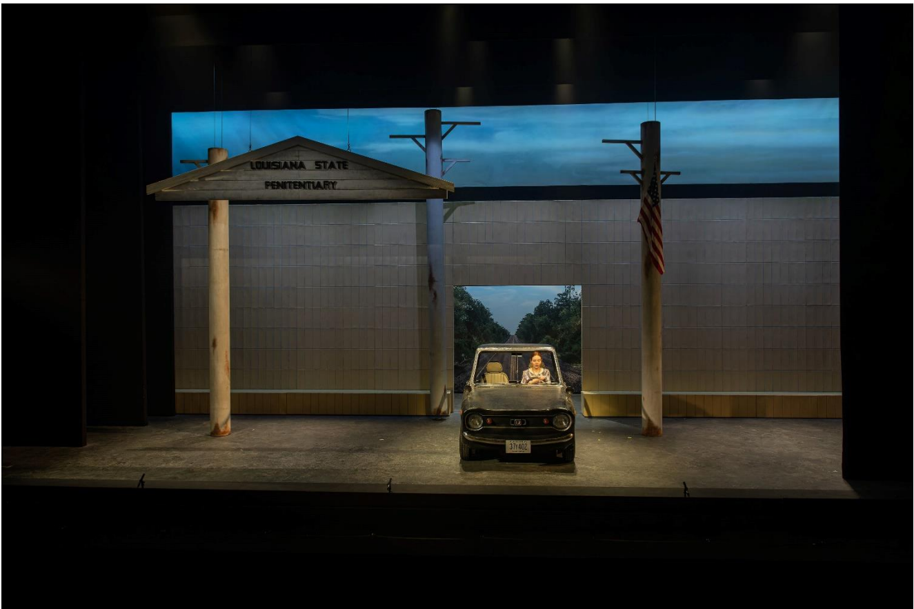
Dead Man Walking, spring 2023