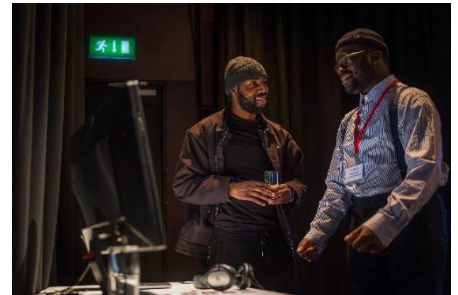
2023 Grad Ex, summer 2023

It has provided hundreds of students with the means to live and study in London, widened horizons, created unrivalled opportunities and enabled the School's international community to adapt and flourish.