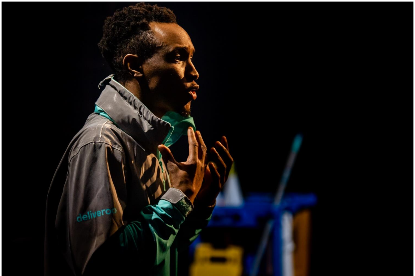
Opera Scenes, autumn 2020