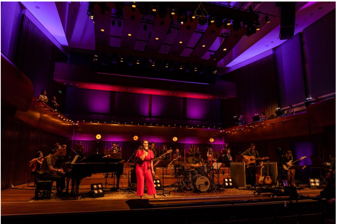
Beatles Reimagined, April 2021

During the summer 2021 events season, a number of individual donors supported the technical support costs for the four opera and drama broadcasts in the summer 2021 events season.