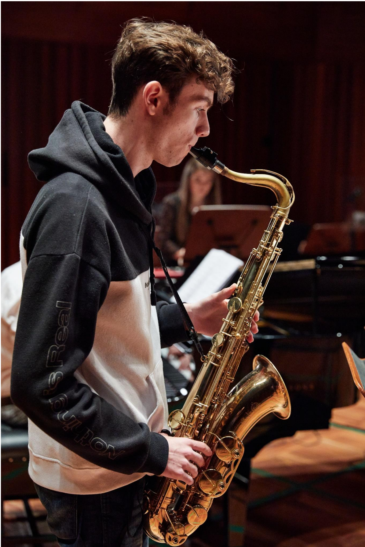
Jazz singers & Jazz bands Milton Court, Oct 2020