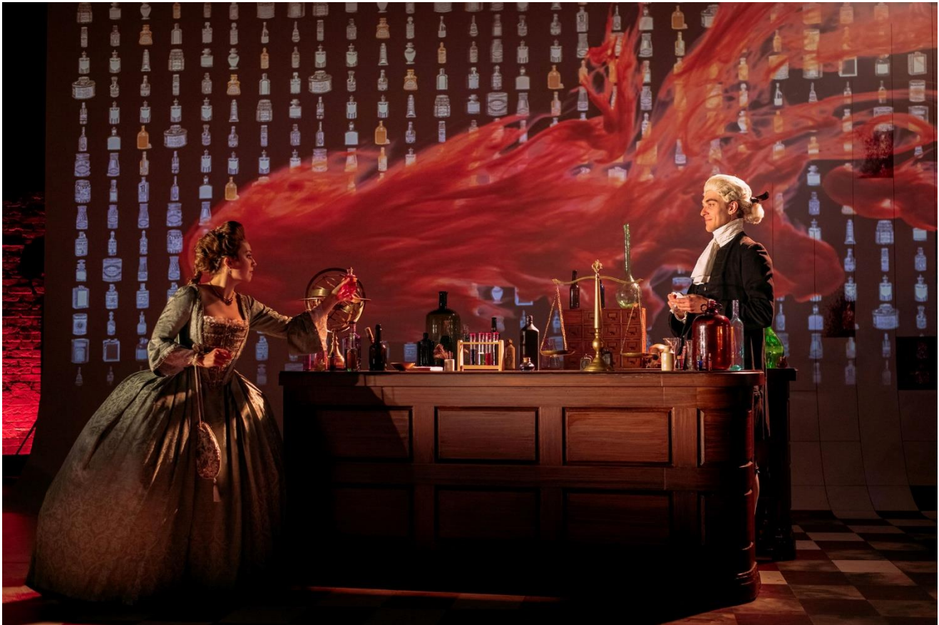
Apothecary , summer 2021