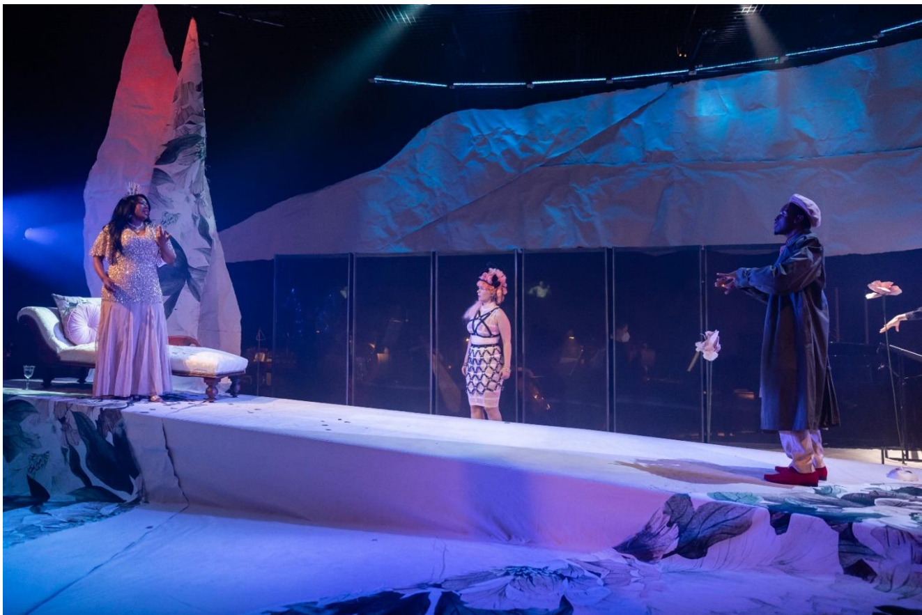
Opera Scenes, July 2021