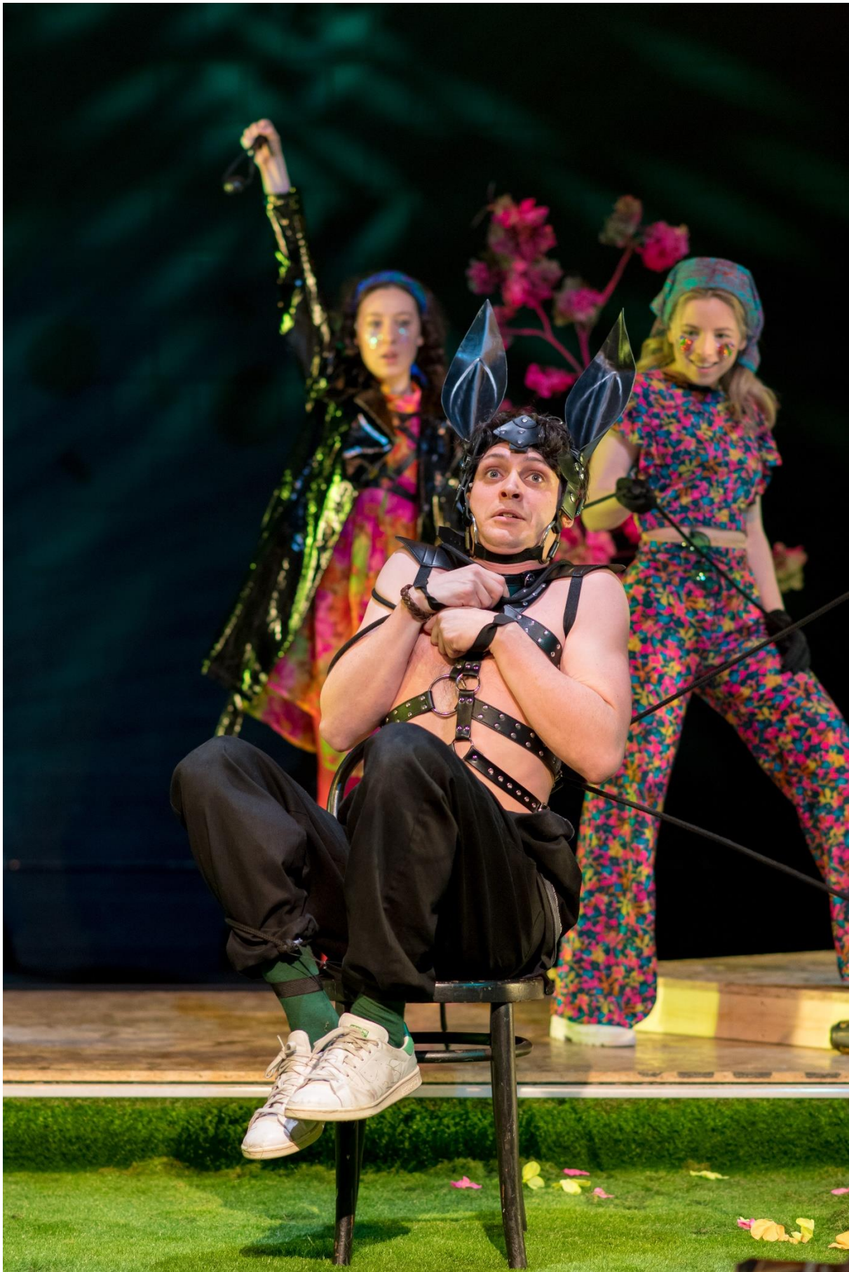
A Midsummer Night's Dream, autumn 2020