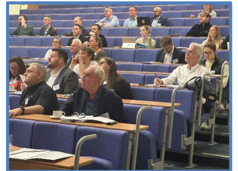
Spring Conference delegates