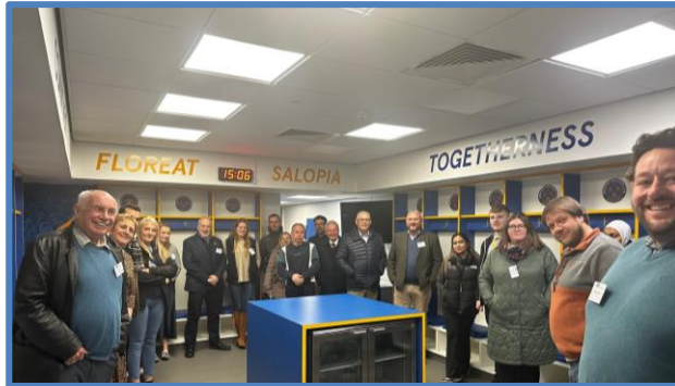
Visit to the changing rooms Shrewsbury Town FC during the Autumn Conference held in the same location