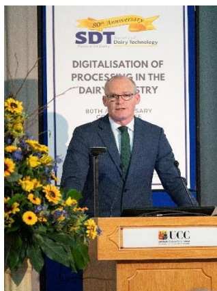
Simon Coveney Ireland's Minister of E, T & E speaking at the 80 th Anniversary Conference