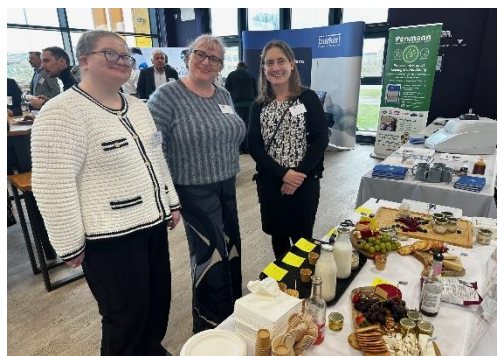
Trade Stand at the Spring Conference