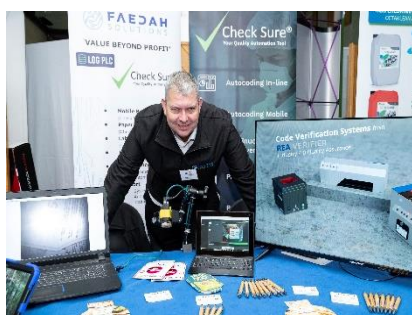
Faedah Solutions Trade Stand, Autumn Conference