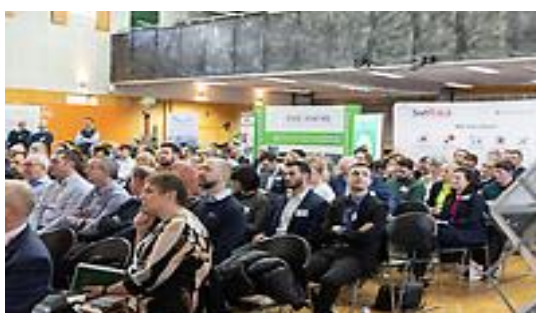
Delegates at 80 th Anniversary Conference