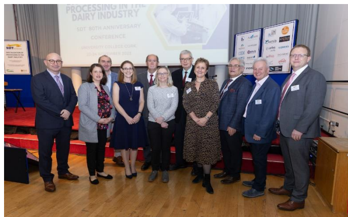
80 th Anniversary Conference Organising Committee