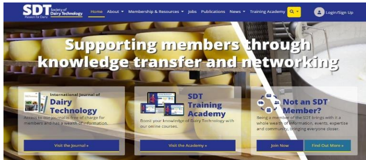
A revamped website declaring our strong purpose and linking to the new SDT Learning Academy