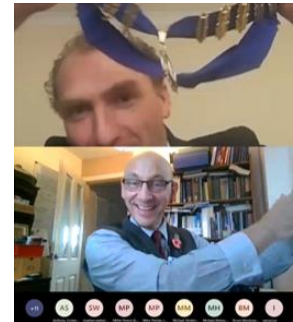
A virtual handover of Presidency