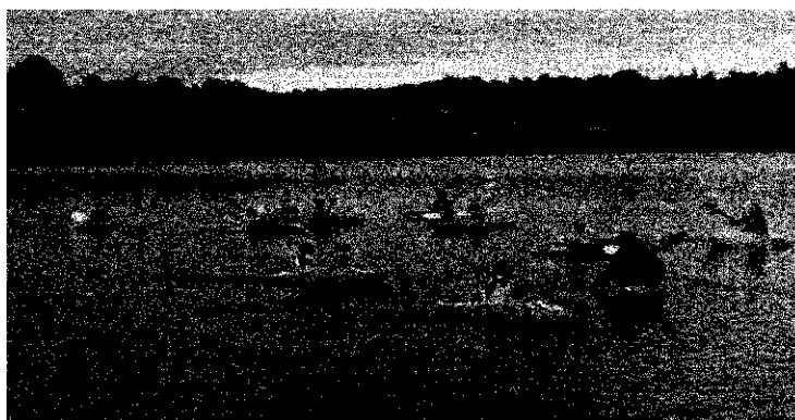
Above (both): Beavers canoeing and kayaking at Blashford - 13 July 2021

leadership and support – so many young people have learnt skills and grown through Scouting because of them. We wish them all the best for their trip up North – and hope that some of our Explorers may be able to plan an Expedition near them in the future.