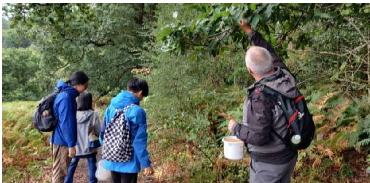
Seed Gathering, autumn 2023

Volunteering at Moor Trees is an opportunity to learn new skills, understand more about forest heritage while helping to improve the environment, support the local community, enhance biodiversity and at the same time improve individuals' mental health and wellbeing. Through our regular, weekly volunteering days the charity benefited from more than 4,500 hours, equivalent to more than 2.5 full-time members of staff.