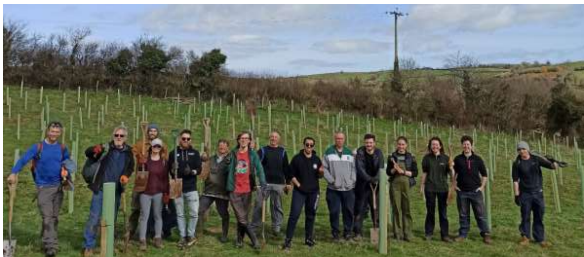
Planting team at Higher Norris Farm

Moor Trees partners with a range of organisations such as the Woodland Trust and Plymouth and South Devon Community Forest to help groups and individuals access funding to support woodland creation in our region. Over the winter of 2022-23, with the help of a diverse cohort of volunteers, we planted more than 18,900 trees covering over 9.3 hectares of land and extending across 1.7km of hedgerow. Our team of volunteers planted 40% more trees this year compared to the previous year. Of the eleven sites we planted, five were in the national park boundary. Nine of the sites were fields which had been historically grazed, and some of these will continue to be used for grazing as the trees are fenced in field corners or small thickets. Of these sites one was funded by the England Woodland Grant Offer and two were funded by the Plymouth and South Devon Community Forest.