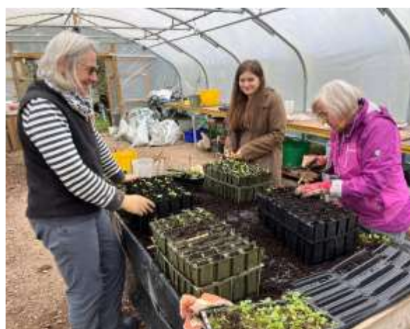
Dartington tree nursery and some of our volunteers