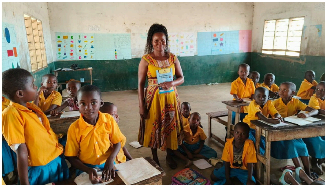
Pupils and teacher at Kibaoni School