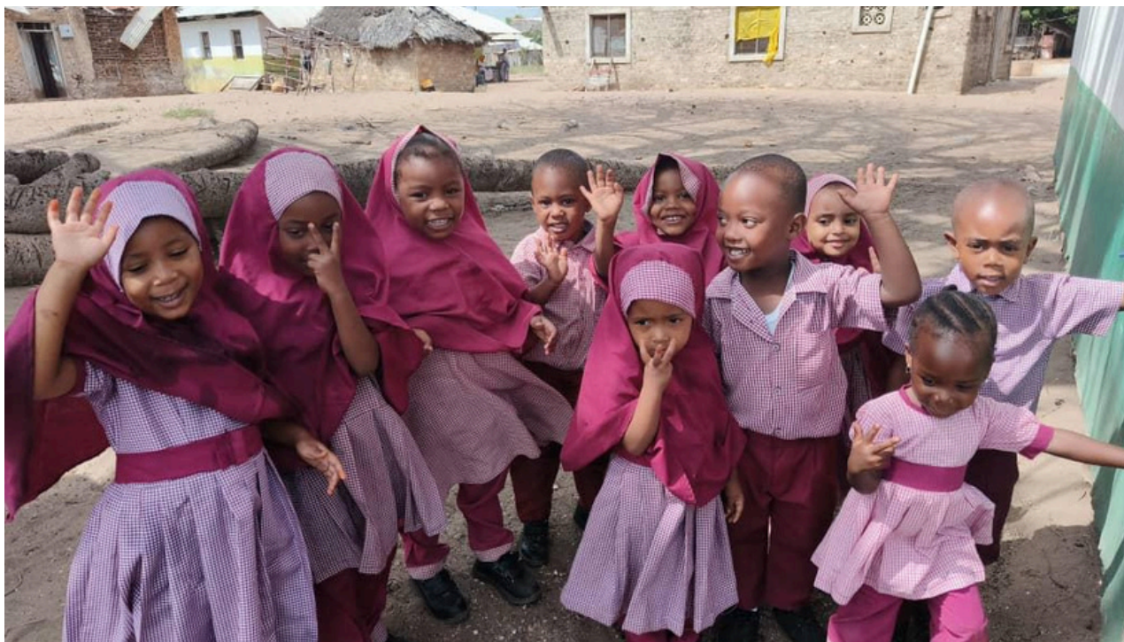
Pupils at Kipungani School

As ever I am as hugely grateful to the KST staff and volunteers as I am to the donors and fund raisers. Without the extraordinary commitment and talents of those on the ground in Kenya, the relentless generosity of our donors would largely go to waste. None of the considerable success of the KST could have been achieved without the dedication of those listed below.