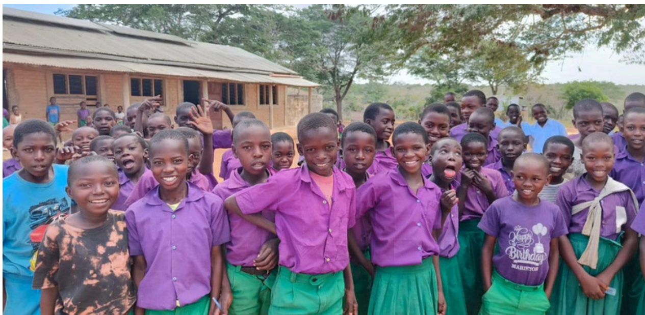
Pupils at Nyamalasameni School