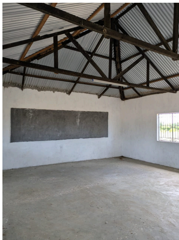
New students of Marikebuni Polytechnic on the left, and on the right, one of the newly completed classrooms