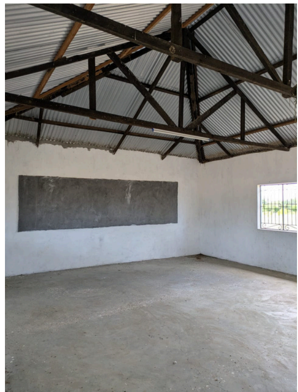
New students of Marikebuni Polytechnic on the left, and on the right, one of the newly completed classrooms