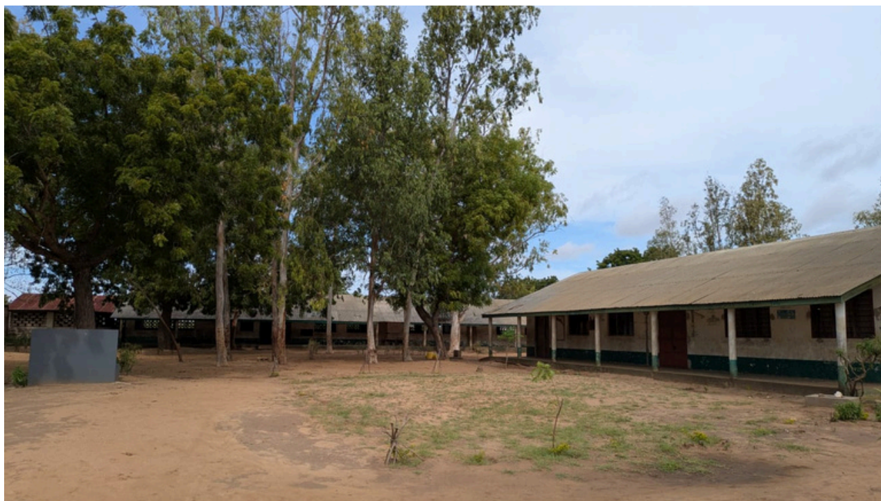
Marikebuni School, next door to the new Marikebuni Polytechnic

As the income of the KST in the 12 months to June 2023 was below the £25,000 threshold that enables one to file an annual report with the Charity Commissioners, this summary of donations and expenditure covers the two last two years!