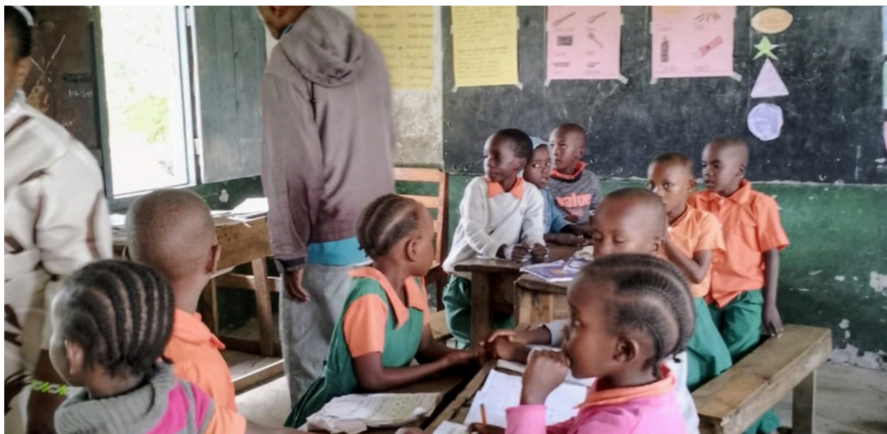
Pupils at Telelani school, near Mpeketoni