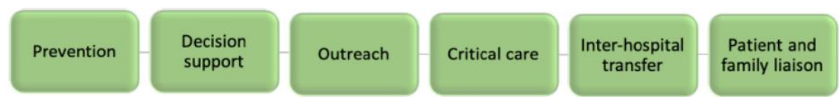
DSAA Clinical Services Pathway of Care

During the period covered by this report much has changed and the service being delivered by Dorset and Somerset Air Ambulance has continued to develop. Many of the elements within the our pathway of care have now linked together working towards a more complete package.