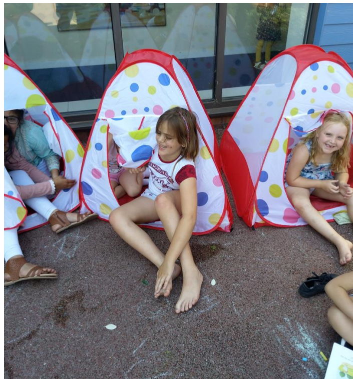
Enjoying the summer weather