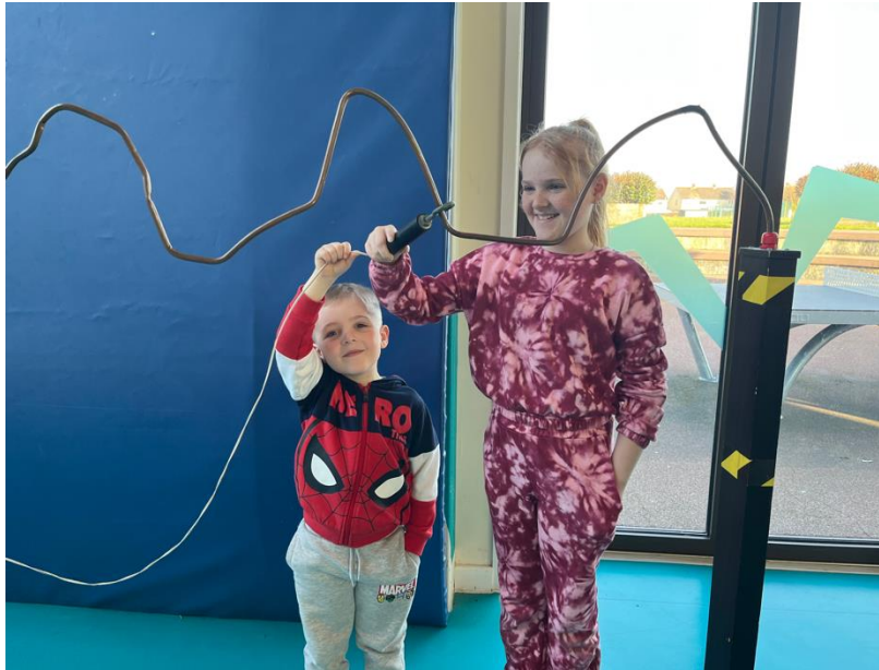
Working together to keep a steady hand