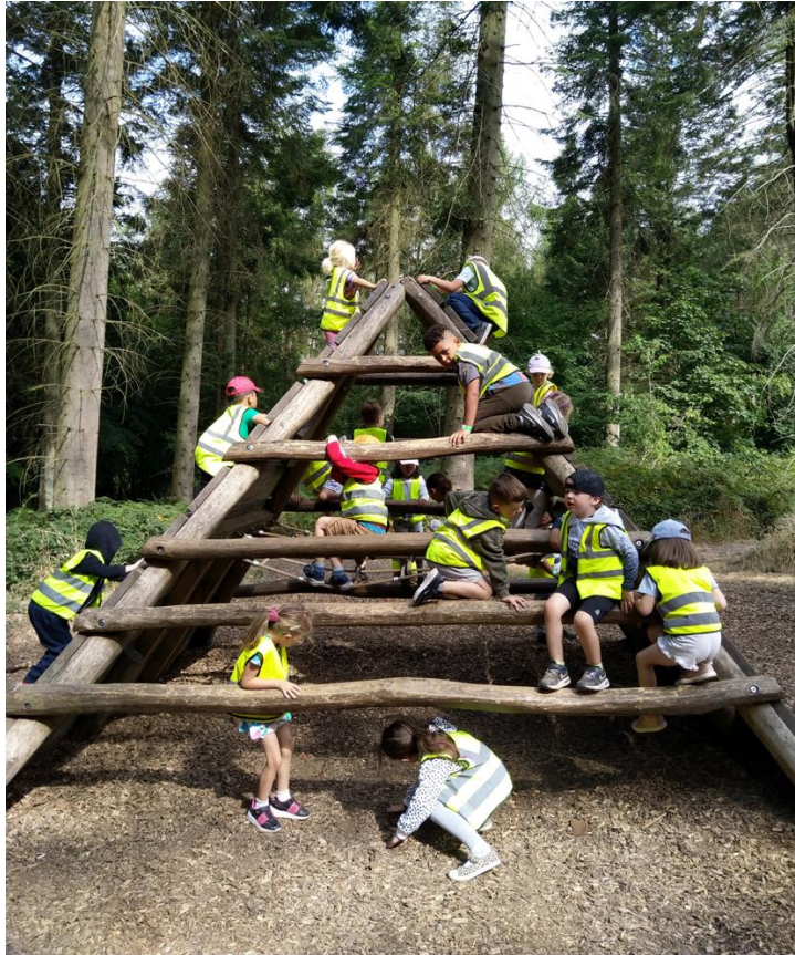
Exploring Wendover Wood