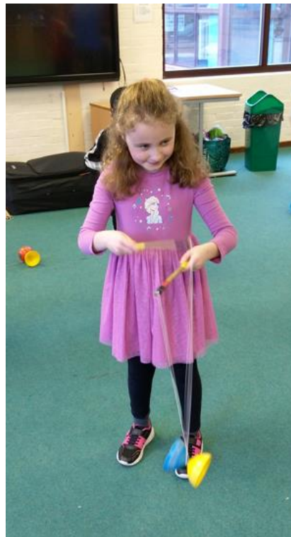
Practicing circus skills