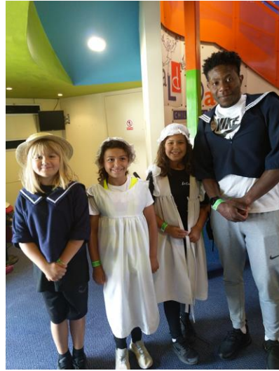
Dressing up at Bucks Museum