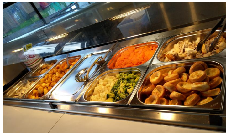
Roast chicken dinner with all the trimmings