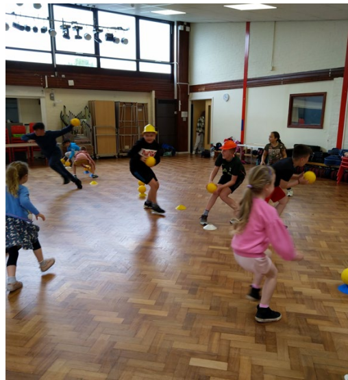
Playing a ball game in the hall