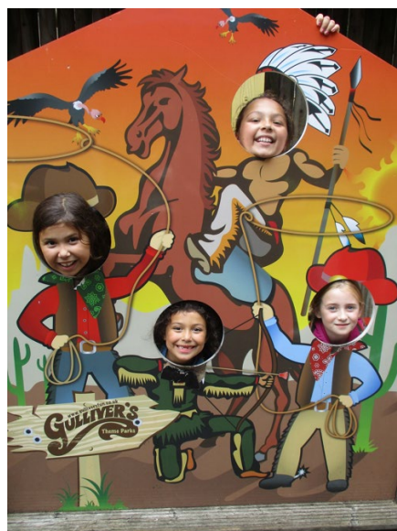
A fun day out at Gulliver's Land