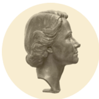
Kathleen Ferrier 1912 ~ 1953