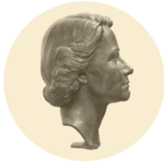
Kathleen Ferrier 1912 – 1953