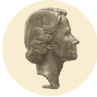
Kathleen Ferrier 1912 – 1953