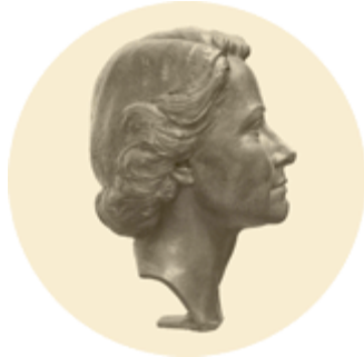
Kathleen Ferrier 1912 – 1953