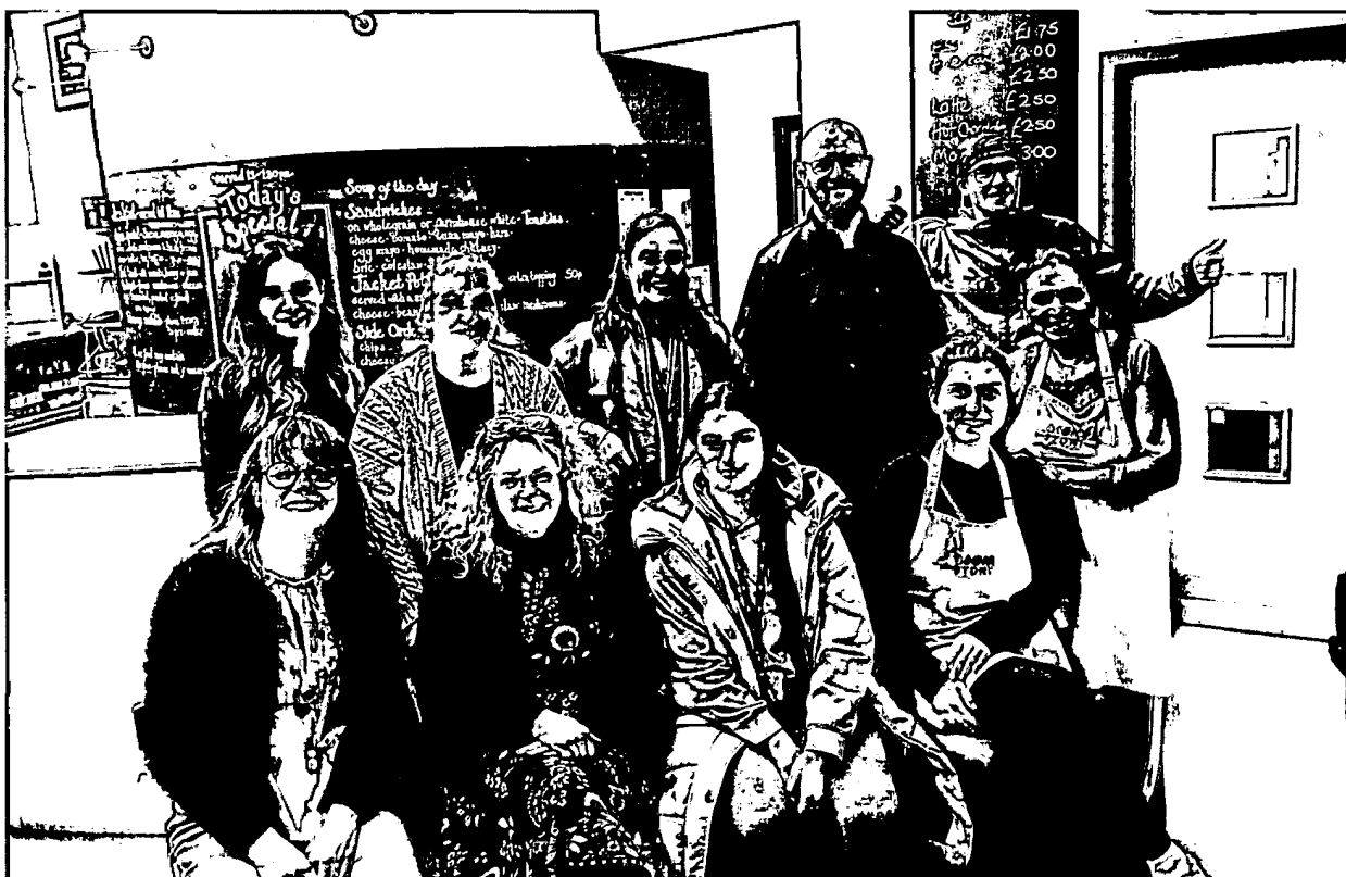
Some of our staff and volunteers in front of the café.

SYDNI would not function without the time and effort of many volunteers to all of whom we would like to extend enormous gratitude. All of whom have made an invaluable contribution to the local community and to SYDNI and we cannot thank them enough.