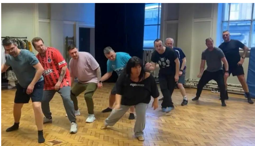
Dance Dads Rehearsal

We had the inaugural meeting of the FANS: Friends of NAPA, a new group of parents and friends who will fundraise for our Big Build Campaign to restore our beloved Grade II* listed home. Their first year was very successful, raising almost £10,000 for our funds via raffles, quiz nights and other donations. The FANS also organised a special performance of a group of dancing dads. The Dance Dads raised almost £4000 for the funds. This group of dedicated fundraisers has brought parents and friends together to support NAPA.