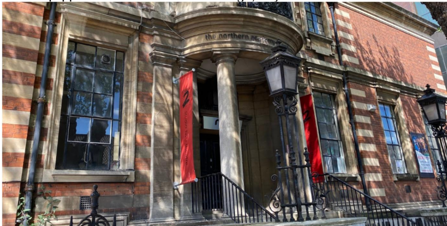
NAPA's home in the centre of Hull

Our building Despite the many successes of the year, our main concern remains our building. We are housed in Hull's former Art School, built in 1904. It's an incredible building, Grade II* listed, perfect for performing arts, with our own well equipped 125 seat theatre and large, airy studios which are bathed in natural light.