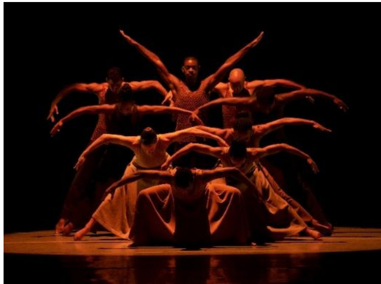
Ailey II Dance Company

New York based Dance Company Ailey II came to NAPA to hold a workshop with our intermediate/senior dancers. The students were given free tickets to watch their performance at Hull New Theatre the night before and were then taught some of the routines here at NAPA. The students absolutely loved the experience and the opportunity to work with such an inspirational international company.