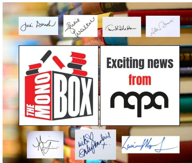
Mono Box Play Library at NAPA

New York based Dance Company Ailey II came to NAPA to hold a workshop with our intermediate/senior dancers. The students were given free tickets to watch their performance at Hull New Theatre the night before and were then taught some of the routines here at NAPA. The students absolutely loved the experience and the opportunity to work with such an inspirational international company.