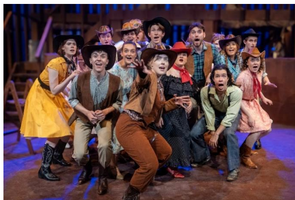
Calamity Jane at Hull Truck Theatre