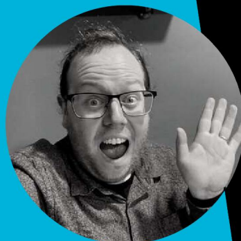
Stephen Fenwick Chair