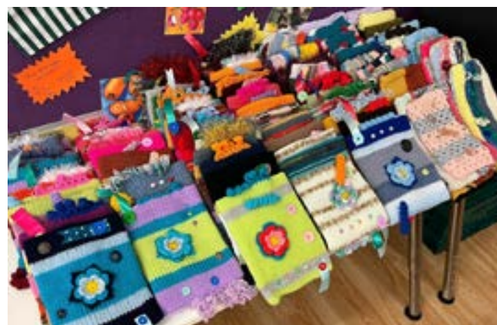
DBL Stitching Group craft items

Each item is sent to various wards and departments across the hospitals, and given to patients to enhance their stay in the hospital. Whether they receive twiddlemuffs supporting dementia care, a beautiful blanket on the Critical Care Unit or a 'traffic light' hat for new-borns, they are all very much appreciated.